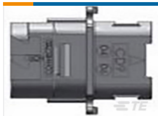
TE Part #ZPF000000000148912 DMC-MD 26 A-T