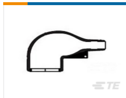
TE Part #EF9981-000 222K121-25L/225-0