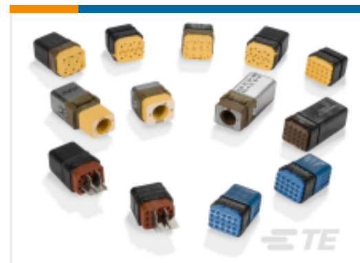
TE Part #ZPF000000000148762 DMC-M 99-04 AN (=33537-P0000)