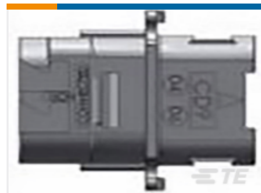
TE Part #ZPF000000000146308 DMC-MD 26 F-K-T