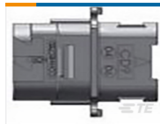
TE Part #ZPF000000000146309 DMC-MD 26 G-K-T