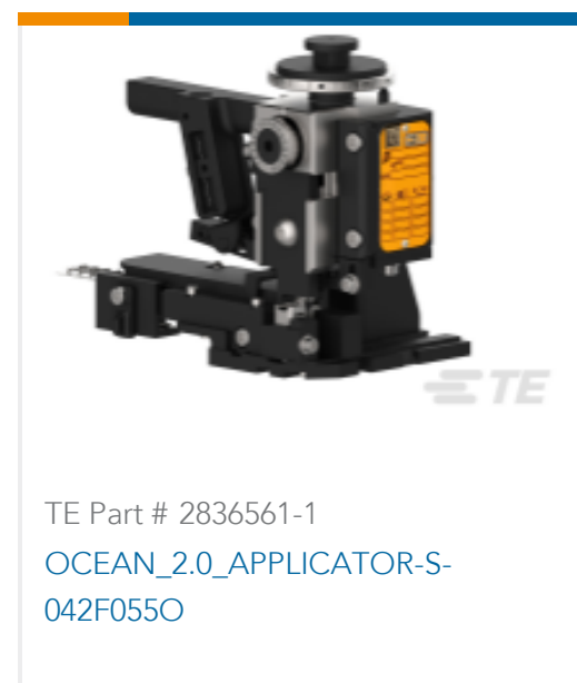
TE Part # 2836561-1 OCEAN_2.0_APPLICATOR-S-042F0550