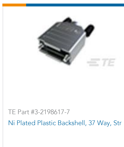
TE Part #3-2198617-7 Ni Plated Plastic Backshell, 37 Way, Str