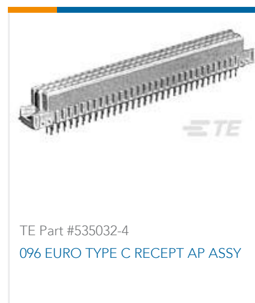
TE Part #535032-4 096 EURO TYPE C RECEPT AP ASSY