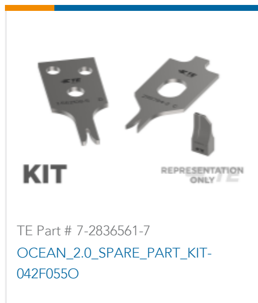
TE Part # 7-2836561-7 OCEAN_2.0_SPARE_PART_KIT-042F0550