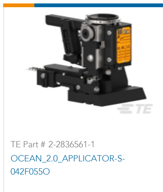
TE Part # 2-2836561-1 OCEAN_2.0_APPLICATOR-S-042F0550