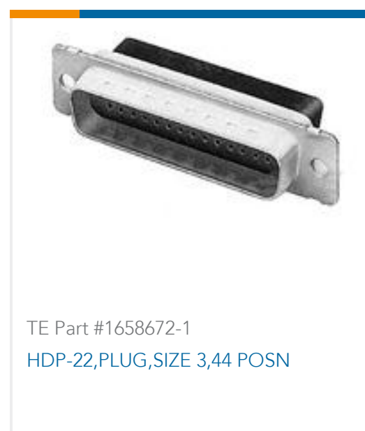
TE Part #1658672-1 HDP-22,PLUG,SIZE 3,44 POSN