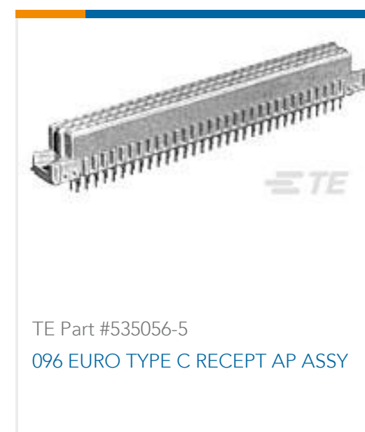
TE Part #535056-5 096 EURO TYPE C RECEPT AP ASSY