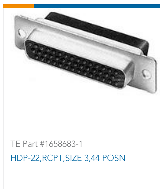
TE Part #1658683-1 HDP-22,RCPT,SIZE 3,44 POSN