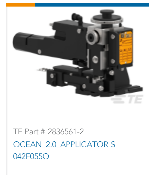
TE Part # 2836561-2 OCEAN_2.0_APPLICATOR-S-042F0550