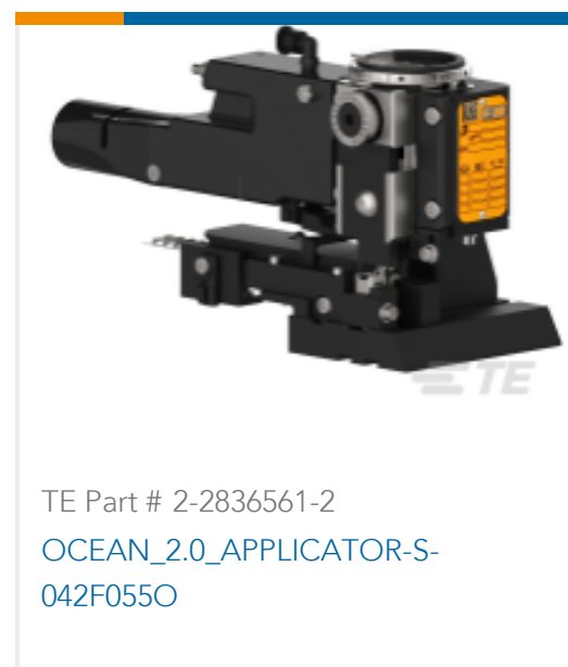
TE Part # 2-2836561-2 OCEAN_2.0_APPLICATOR-S-042F0550