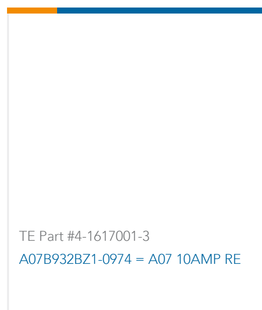
TE Part #4-1617001-3 A07B932BZ1-0974 = A07 10AMP RE