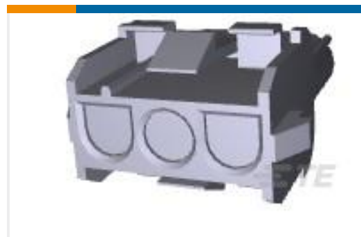
TE Part #1586849-1 03P UMNL CAP HSG NATL, GW