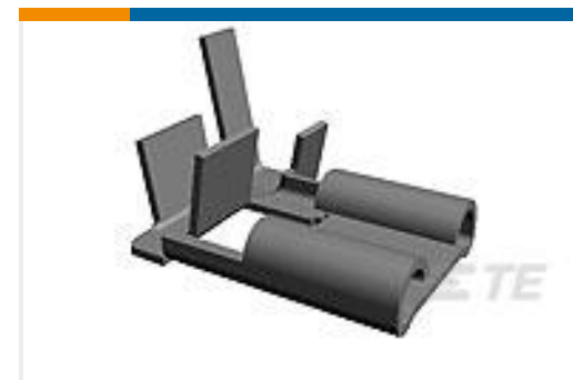
TE Part #62811-1 250 FASTON FLAG REC 18-14 AWG BR