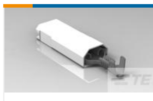
TE Part #520988-1 ULTRA-POD 250 ASSY REC 22-18 AWG BR