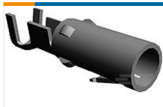
TE Part #61085-1 .156 MNL SOK PTPBR