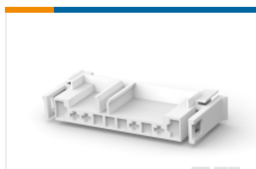
TE Part #1897058-1 CONNECTOR .125/.250 SERIES