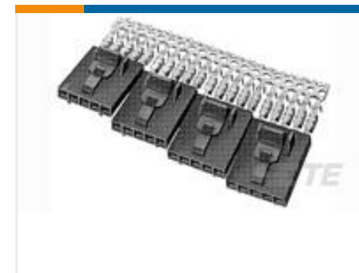
TE Part #1-103957-3 8X3 MTE RCPT SR LATCH .100CL