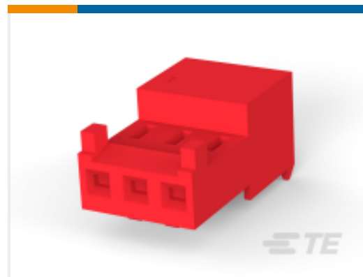
TE Part #3-643813-9 Nylon Tin Plated Receptacle: 2.54mm, With Mating Alignment, MTA 100