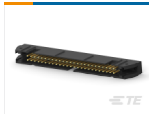
TE Part #499922-6 AMP-LATCH UNIVERSAL HEADERS