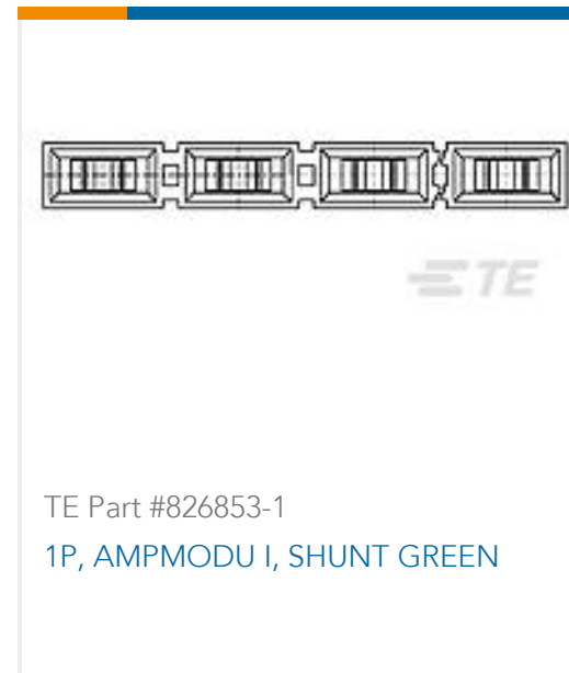
TE Part #826853-1 1P, AMPMODU I, SHUNT GREEN