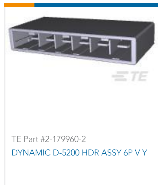
TE Part #2-179960-2 DYNAMIC D-5200 HDR ASSY 6P V Y