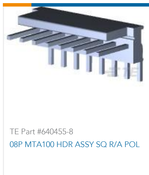
TE Part #640455-8 08P MTA100 HDR ASSY SQ R/A POL