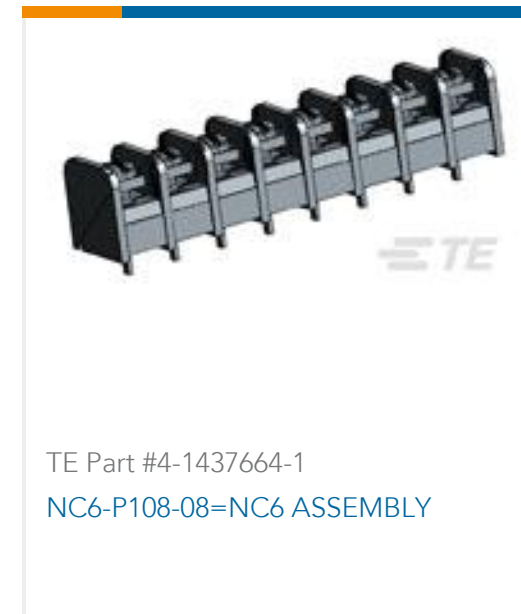
TE Part #4-1437664-1 NC6-P108-08=NC6 ASSEMBLY