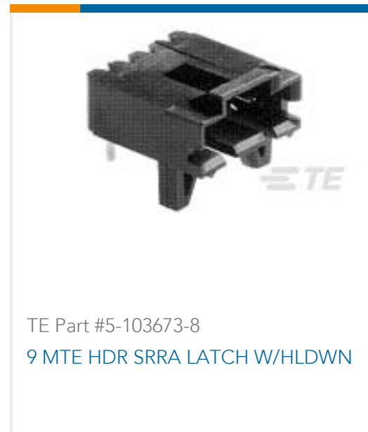
TE Part #5-103673-8 9 MTE HDR SRRA LATCH W/HLDWN