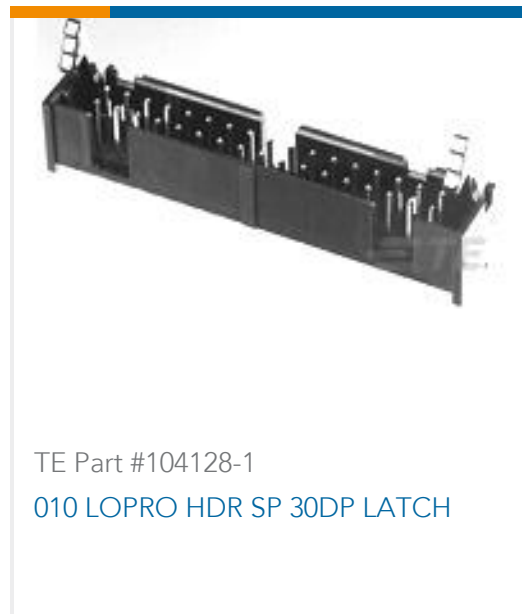
TE Part #104128-1 010 LOPRO HDR SP 30DP LATCH