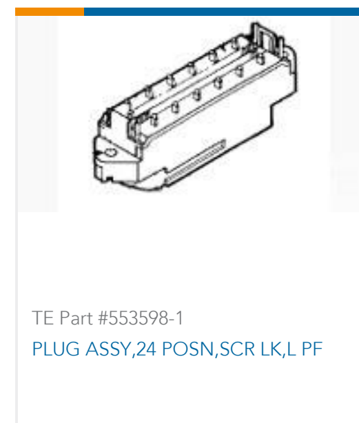
TE Part #553598-1 PLUG ASSY,24 POSN,SCR LK,L PF