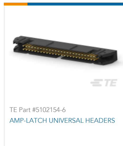
TE Part #5102154-6 AMP-LATCH UNIVERSAL HEADERS