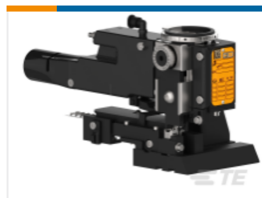
TE Part # 2-2151428-2 OCEAN-2.0-APPLICATOR-S-042F055OA