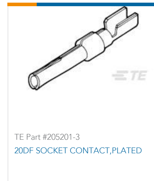
TE Part #205201-3 20DF SOCKET CONTACT, PLATED