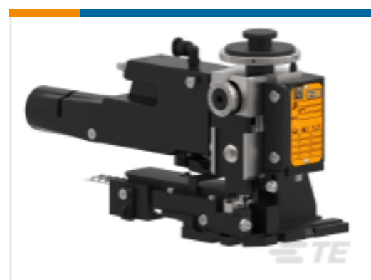
TE Part # 2837445-2 OCEAN_2.0_Applicator-S-042F062OA