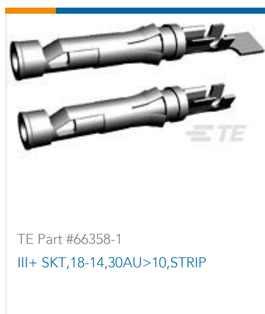
TE Part #66358-1 III+ SKT, 18-14, 30AU>10, STRIP