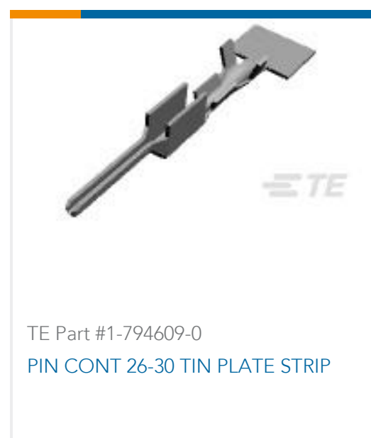
TE Part #1-794609-0 PIN CONT 26-30 TIN PLATE STRIP