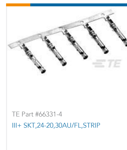
TE Part #66331-4 III+ SKT, 24-20, 30AU/FL, STRIP