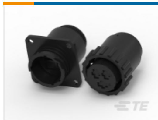
TE Part # CAT-AM71-C83998BB CPC SERIES 3