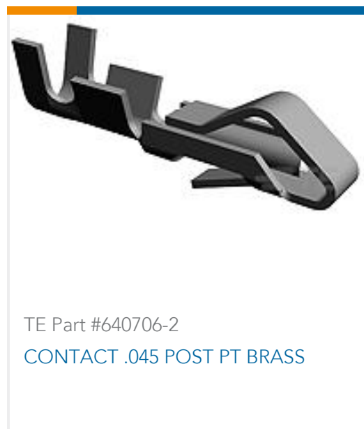
TE Part #640706-2 CONTACT .045 POST PT BRASS