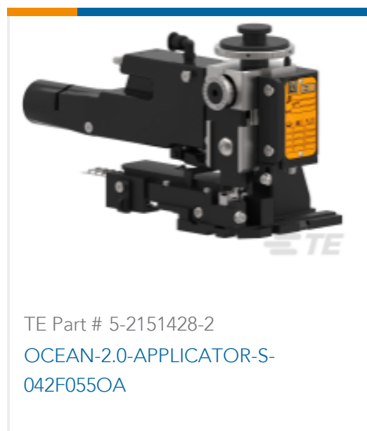
TE Part # 5-2151428-2 OCEAN-2.0-APPLICATOR-S-042F055OA