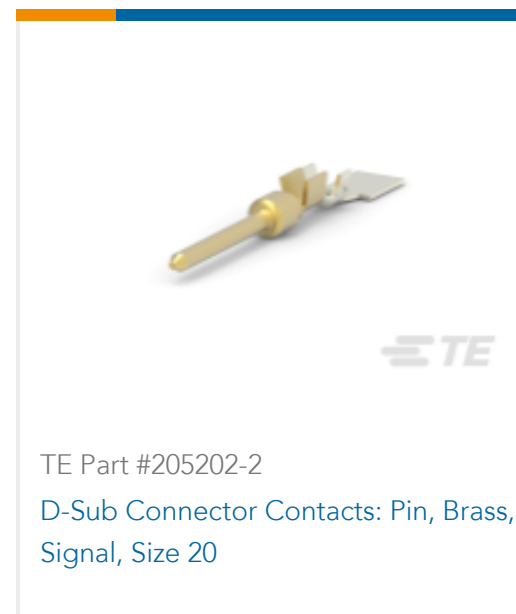
TE Part #205202-2 D-Sub Connector Contacts: Pin, Brass, Signal, Size 20