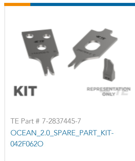
TE Part # 7-2837445-7 OCEAN_2.0_SPARE_PART_KIT-042F062O