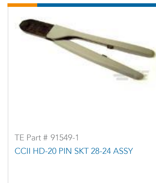
TE Part # 91549-1 CCII HD-20 PIN SKT 28-24 ASSY