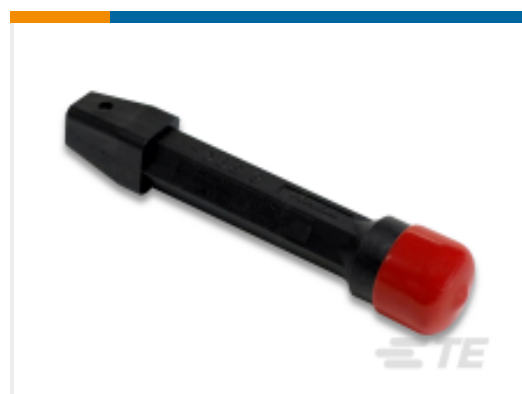
TE Part # 91285-1 INSERT/EXTRACT TOOL ASSEMBLY