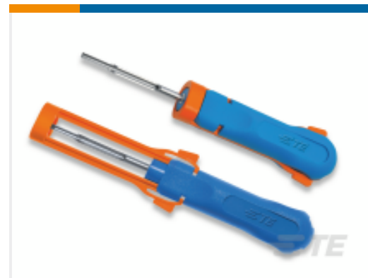
TE Part # 1579007-9 EXTRACTION TOOL