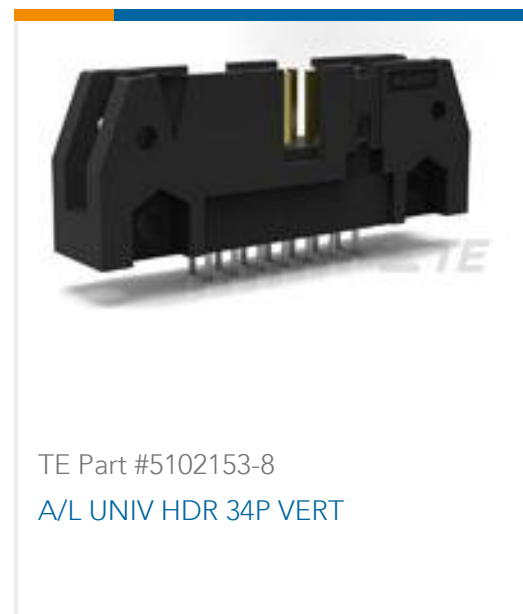
TE Part #5102153-8 A/L UNIV HDR 34P VERT