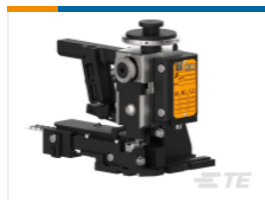
TE Part # 5-2151428-1 OCEAN-2.0-APPLICATOR-S-042F055O