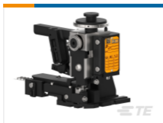
TE Part # 2151428-1 OCEAN-2.0-APPLICATOR-S-042F055O