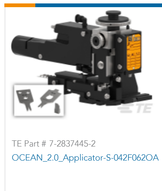
TE Part # 7-2837445-2 OCEAN_2.0_Applicator-S-042F062OA