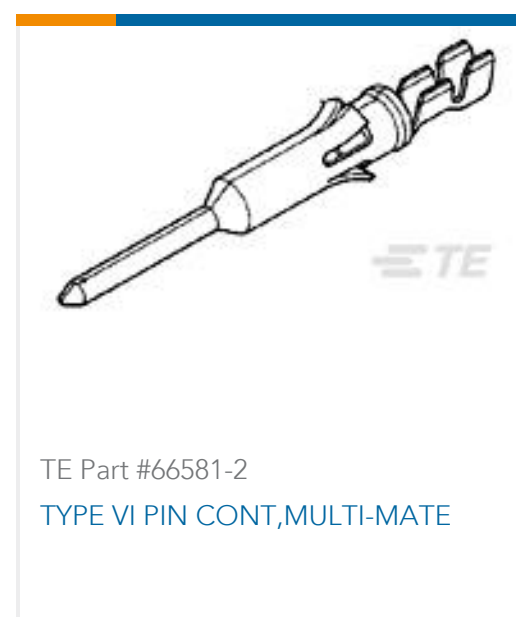
TE Part #66581-2 TYPE VI PIN CONT, MULTI-MATE