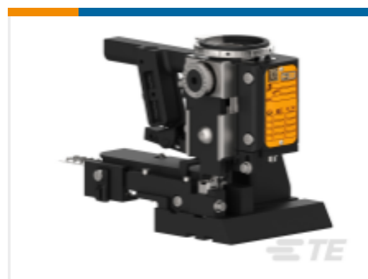
TE Part # 2-2151428-1 OCEAN-2.0-APPLICATOR-S-042F055O