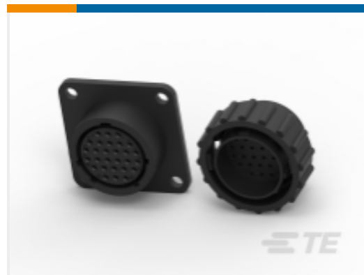
TE Part # CAT-AM71-C83998M CPC SERIES 2