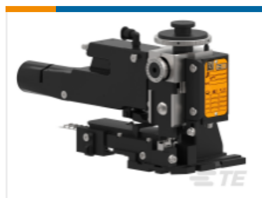
TE Part # 2151428-2 OCEAN-2.0-APPLICATOR-S-042F055OA