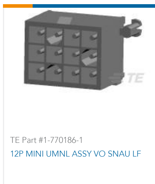
TE Part #1-770186-1 12P MINI UMNL ASSY VO SNAU LF