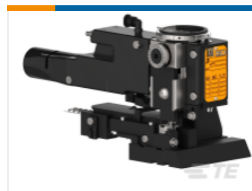
TE Part # 2-2837445-2 OCEAN_2.0_Applicator-S-042F062OA