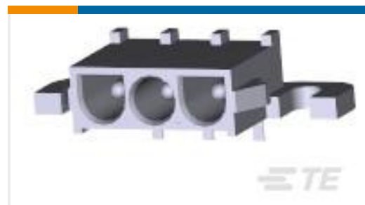
TE Part #1-350943-0 03P UMNL HDR ASSY R/A 94VO