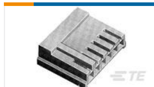
TE Part #171822-6 EIS REC. HSG 6P-NATURAL