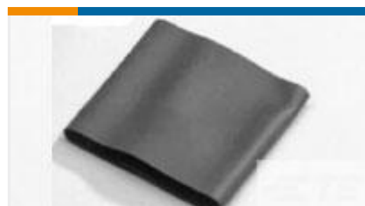
TE Part #080745J001 V2-1.0-0-SP-SM