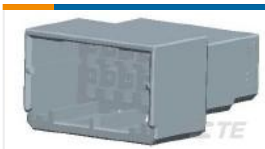
TE Part #1-1903130-6 DYNAMIC 1200D TAB HSG 12P F/H