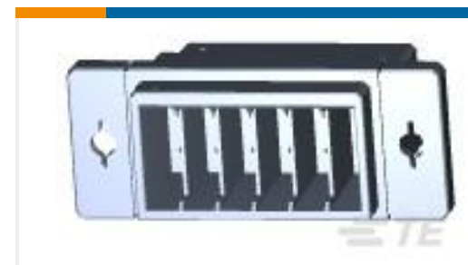
TE Part #917241-6 DYNAMIC D-3500 WTW TAB HSG 12P