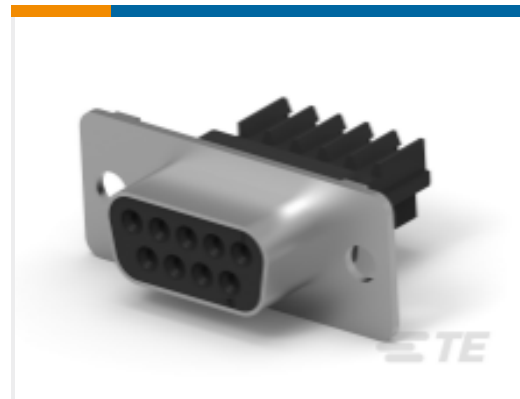
TE Part # CAT-AM7-248H8 IDC D-Sub: Receptacle Assembly, Wire to Wire, Signal, 2.74 mm