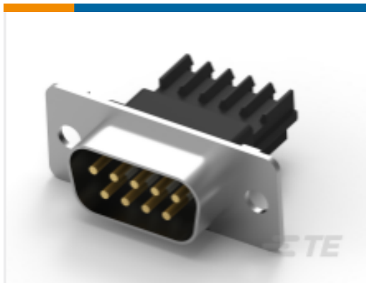
TE Part # CAT-AM7-248H3 IDC D-Sub: Plug Assembly, Wire to Wire, Signal, 2.77 mm