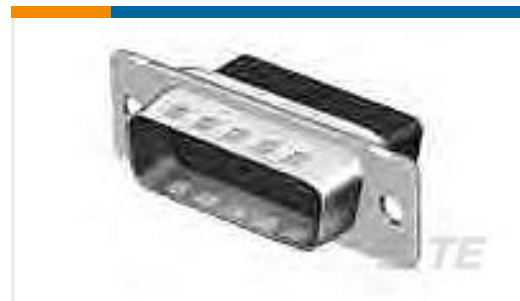
TE Part #205204-9 CRIMP SNAP PLUG ASSY, SIZE 1