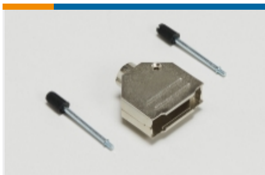
D-Sub Backshells & Clamps(5)