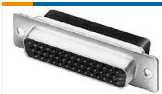
TE Part #1658681-1 HDP-22, RCPT, SIZE 1, 15 POSN