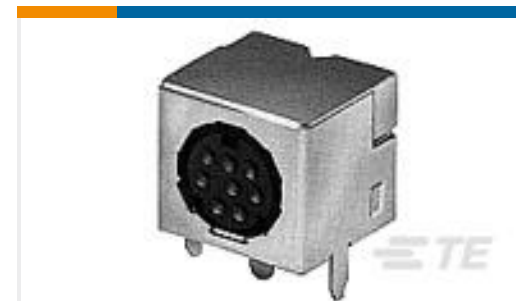
TE Part #5749264-1 Mini DIN, 4 pos, R/A, Shield