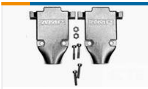
TE Part #5748676-5 DIE CAST CBL CLMP KIT,SZ 5