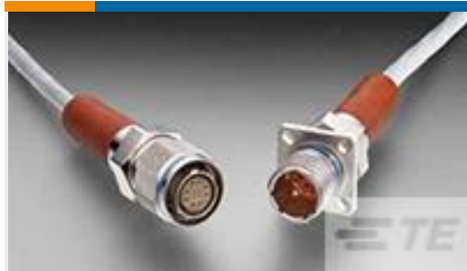
TE Part #YCFX24W1108SZN0000 RECP ASSY