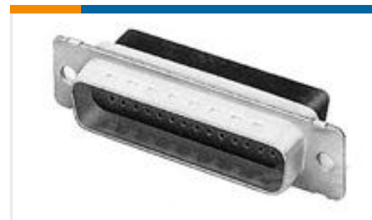
TE Part #748364-1 15 HD22 CRIMP SNAP PLUG