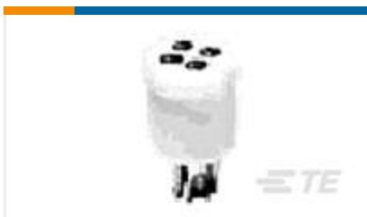
TE Part #1437508-5 8058-1G19=TO5 SOCKET 200 CIRC