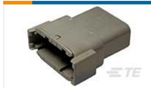
TE Part #DTM04-12PA REC, 12P, GRY, N, A