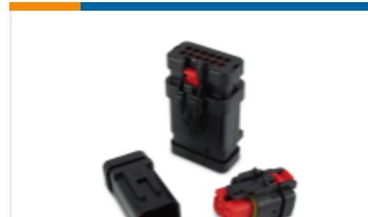
TE Part #2040594-5 AMPSEAL 16 HOUSINGS