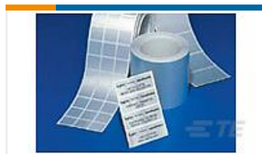
TE Part #A37084-000 MP-381064-10-8A