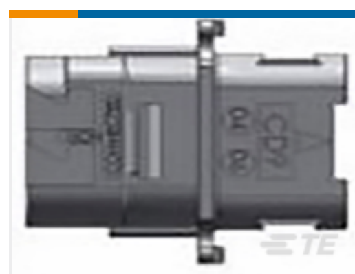
TE Part #ZPF000000000146308 DMC-MD 26 F-K-T