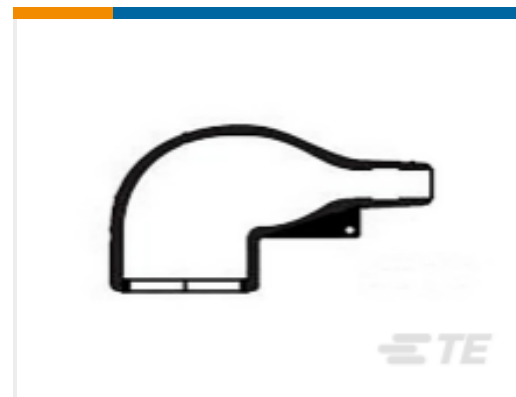
TE Part #EF9981-000 222K121-25L/225-0