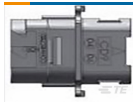
TE Part #ZPF000000000146309 DMC-MD 26 G-K-T