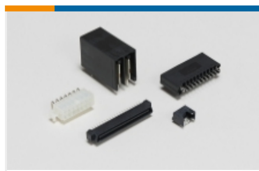
Standard Rectangular Connectors (1718)