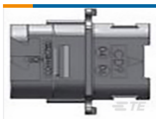
TE Part #ZPF000000000148912 DMC-MD 26 A-T