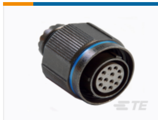
TE Part #YACT26MA98SEV00100 STRAIGHT PLUG