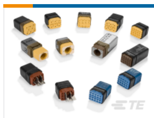
TE Part #ZPF000000000148762 DMC-M 99-04 AN (=33537-P0000)