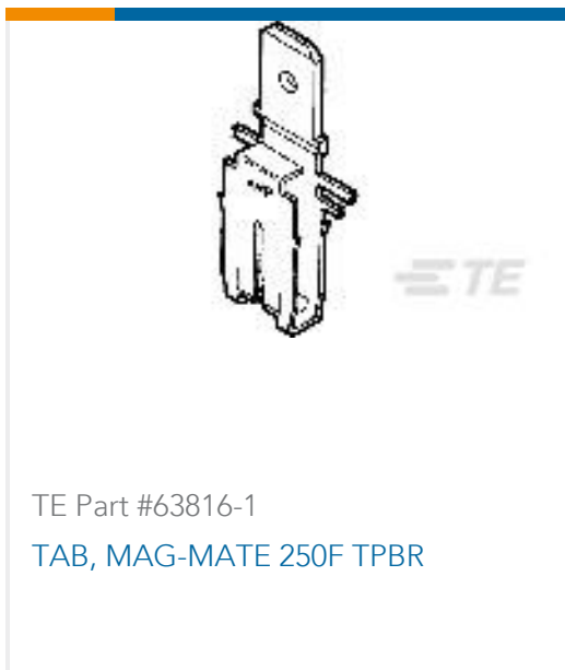
TE Part #63816-1 TAB, MAG-MATE 250F TPBR