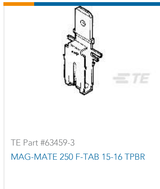
TE Part #63459-3 MAG-MATE 250 F-TAB 15-16 TPBR