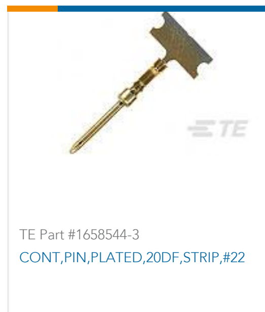
TE Part #1658544-3 CONT, PIN, PLATED, 20DF, STRIP, #22