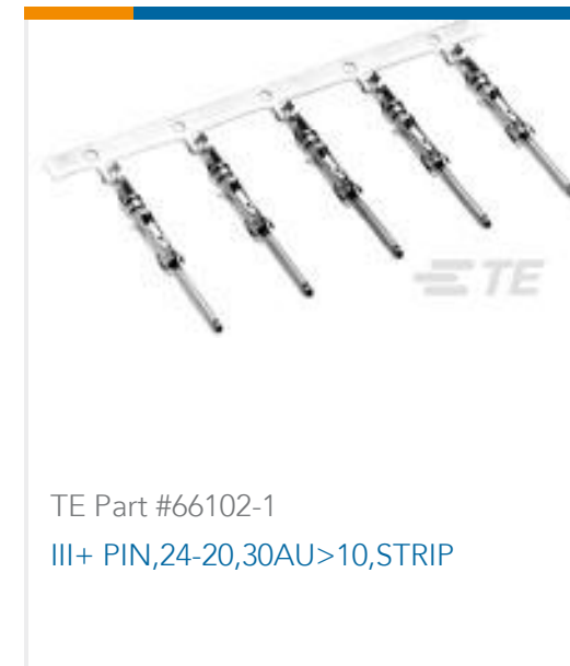
TE Part #66102-1 III+ PIN, 24-20, 30AU > 10, STRIP