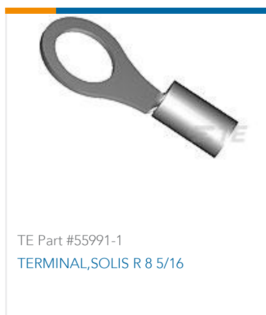
TE Part #55991-1 TERMINAL, SOLIS R 8 5/16