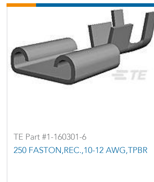
TE Part #1-160301-6 250 FASTON, REC., 10-12 AWG, TPBR