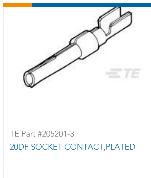
TE Part #205201-3 20DF SOCKET CONTACT, PLATED