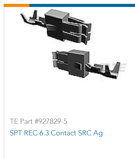
TE Part #927829-5 SPT REC 6.3 Contact SRC Ag