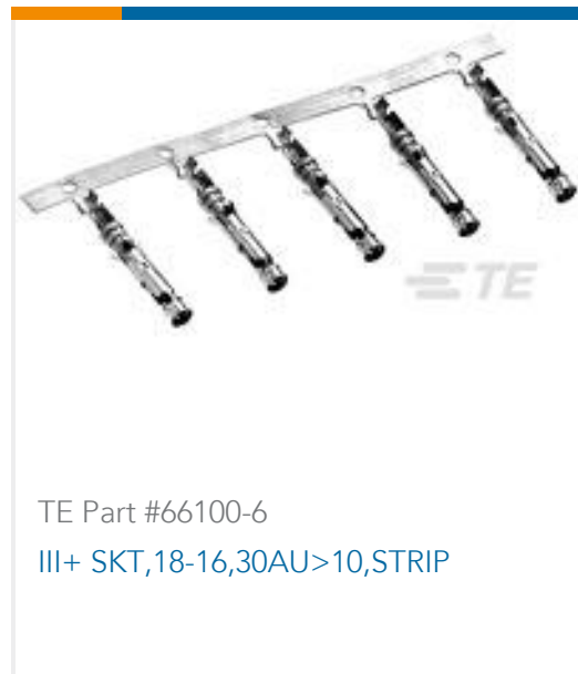
TE Part #66100-6 III+ SKT, 18-16, 30AU > 10, STRIP