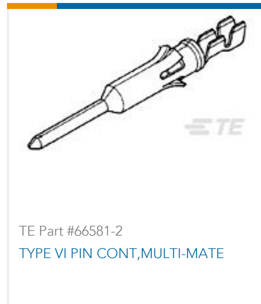
TE Part #66581-2 TYPE VI PIN CONT, MULTI-MATE