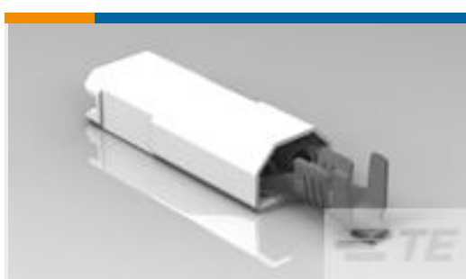
TE Part #521225-2 ULTRA-POD 187 ASSY REC 20-16 AWG TPBR