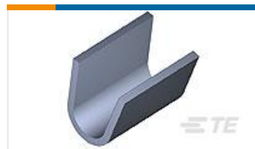
TE Part #63130-2 SPLICE REC. 1500-5000 .020 BR