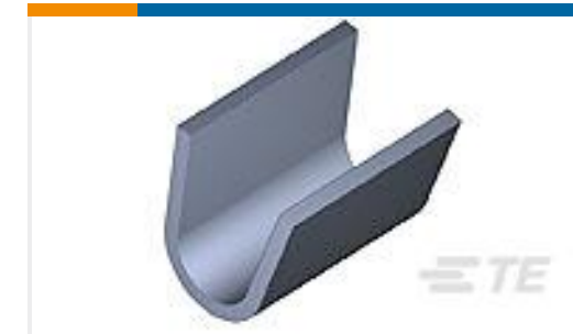
TE Part #485043-1 SPLICE 4000-9000 .020 BR