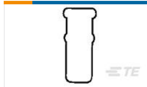
TE Part #2-324485-1 WIRE CAP RED .080-.115