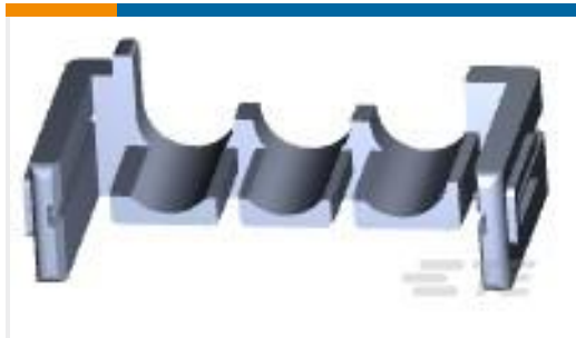
TE Part #177919-1 POWER DBL LOCK PLATE 3P