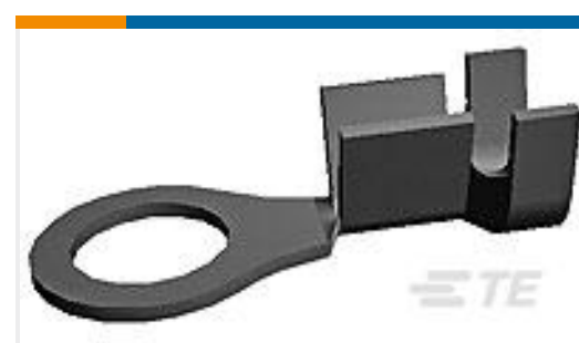
TE Part #41346 RING TERMINAL 18-14 AWG NPSTL