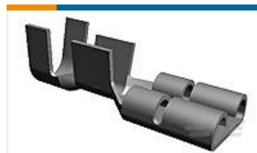
TE Part #63306-1 250 FASTON REC 18-14 AWG BR