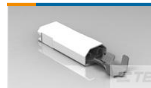
TE Part #521632-2 ULTRA-POD 250 ASSY REC 18-14 AWG TPBR