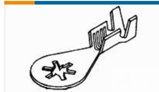
TE Part #61793-1 RING 18-14 AWG TPST