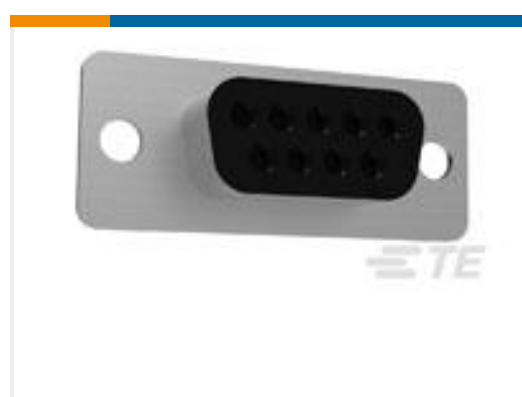
TE Part #205203-3 CRIMP SNAP RCPT ASSY, SIZE 1