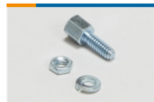
D-Sub Locking & Mounting(122)