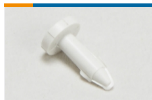
D-Sub Contact Accessories(1)