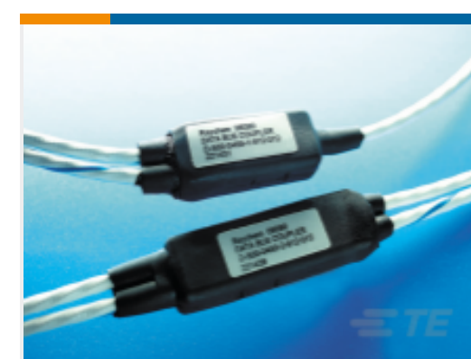
TE Part #500557-000 D-500-0255-212