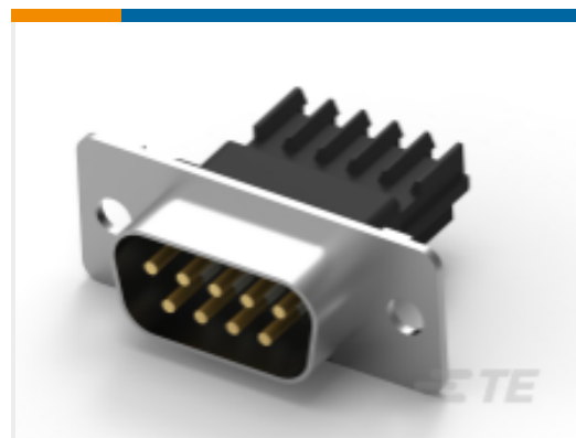
TE Part # CAT-AM7-248H3 IDC D-Sub: Plug Assembly, Wire to Wire, Signal, 2.77 mm