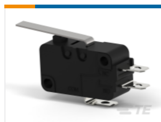
TE Part #2351458-1 SMINSA SW HLV 0.49N. 5A AC DT SLD