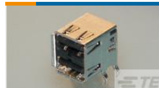
TE Part # 5787745-1 USB A R/A STAK ASSY THRU HOLE