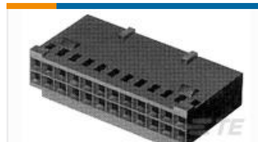
TE Part # 87631-3 08 MODIV HSG COMP DR .100 POL