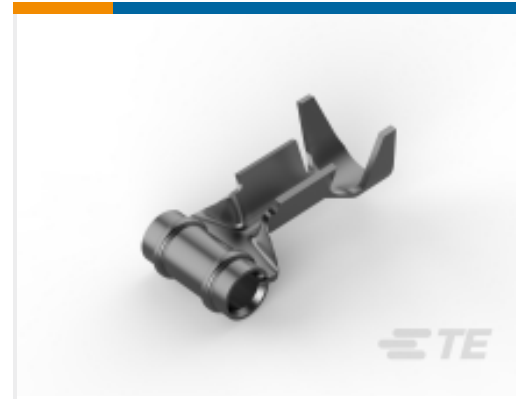
TE Part # 61323-2 058 R/A PIN REC 24-20 TPBECU