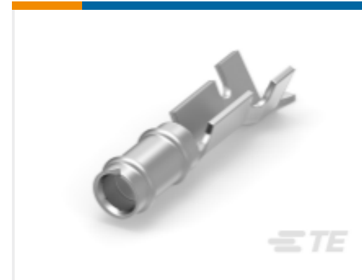
TE Part # 60804-3 RECPT .058 26-22 SN/BECU