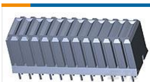
TE Part # 120953-3 UPM EXPANDED RCPT ASSEMBLY