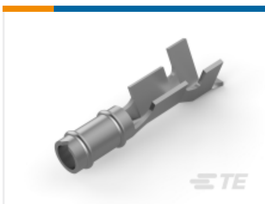
TE Part # 60939-2 .058 DIA RECPT SN/BECU