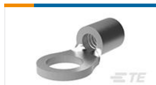
TE Part # 2-324955-1 TERMINAL,SOLIS R 16-14 8