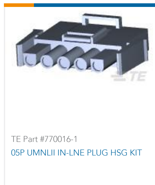
TE Part #770016-1 05P UMNLII IN-LNE PLUG HSG KIT