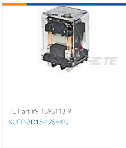
TE Part #9-1393113-9 KUEP-3D15-125=KU