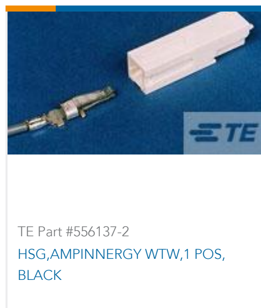
TE Part #556137-2 HSG,AMPINERGY WTW,1 POS, BLACK