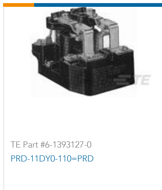
TE Part #6-1393127-0 PRD-11DY0-110=PRD