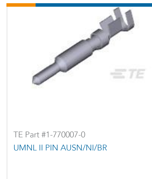
TE Part #1-770007-0 UMNL II PIN AUSN/NI/BR