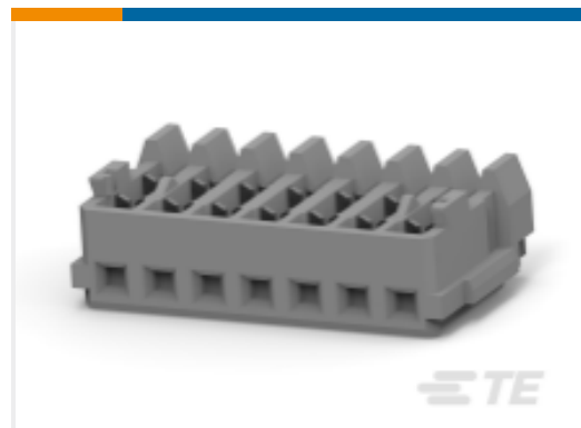
TE Part #353908-3 Mini Common Termination (CT) Housings