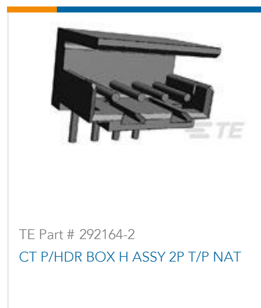
TE Part # 292164-2 CT P/HDR BOX H ASSY 2P T/P NAT