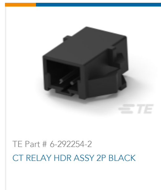
TE Part # 6-292254-2 CT RELAY HDR ASSY 2P BLACK