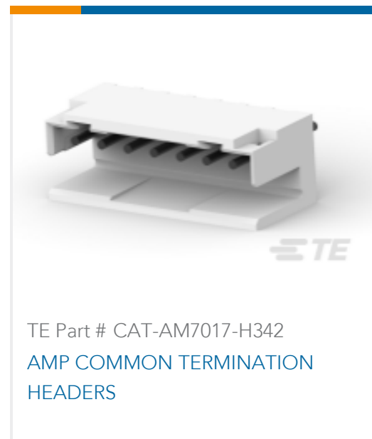
TE Part # CAT-AM7017-H342 AMP COMMON TERMINATION HEADERS