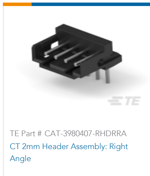
TE Part # CAT-3980407-RHDRRA CT 2mm Header Assembly: Right Angle