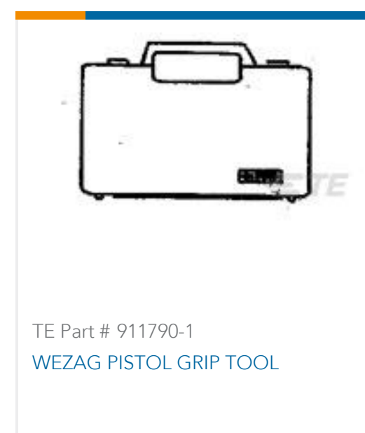
TE Part # 911790-1 WEZAG PISTOL GRIP TOOL