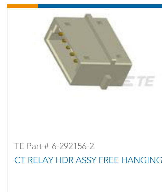
TE Part # 6-292156-2 CT RELAY HDR ASSY FREE HANGING