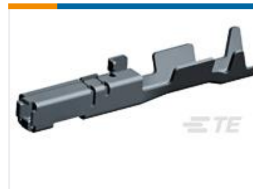
TE Part #1674311-1 0.64III RCPT NON SEALED (TYPE1)