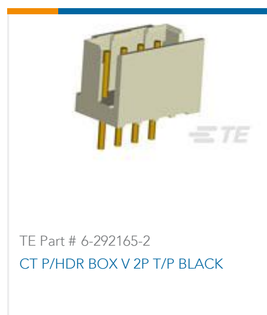
TE Part # 6-292165-2 CT P/HDR BOX V 2P T/P BLACK