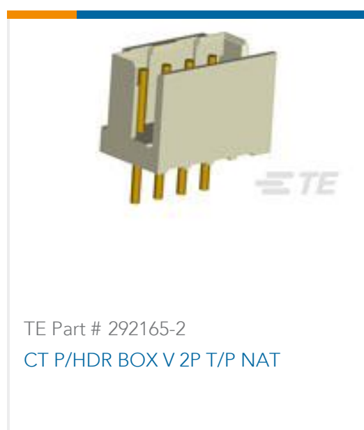
TE Part # 292165-2 CT P/HDR BOX V 2P T/P NAT