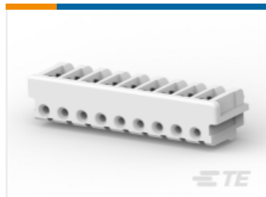
TE Part #173977-4 AMP COMMON TERMINATION HOUSINGS