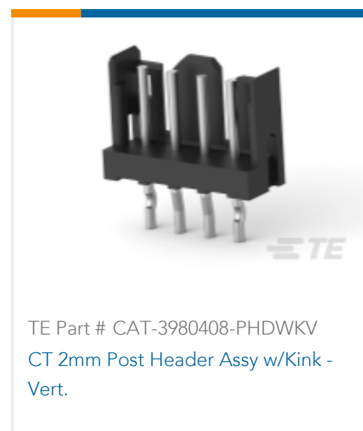
TE Part # CAT-3980408-PHDWKV CT 2mm Post Header Assy w/Kink - Vert.