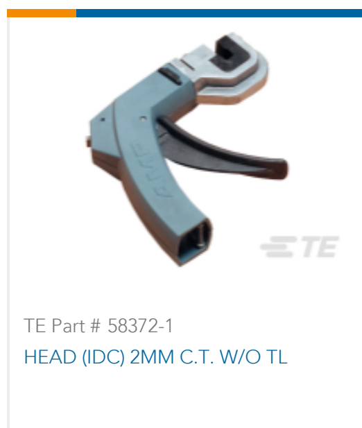
TE Part # 58372-1 HEAD (IDC) 2MM C.T. W/O TL