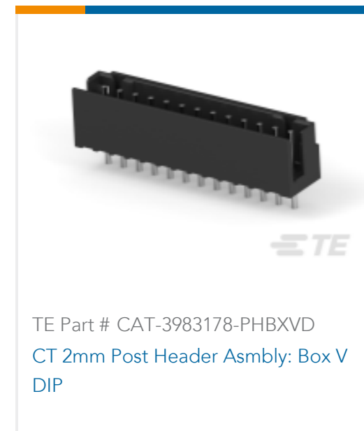
TE Part # CAT-3983178-PHBXVD CT 2mm Post Header Asmbly: Box V DIP