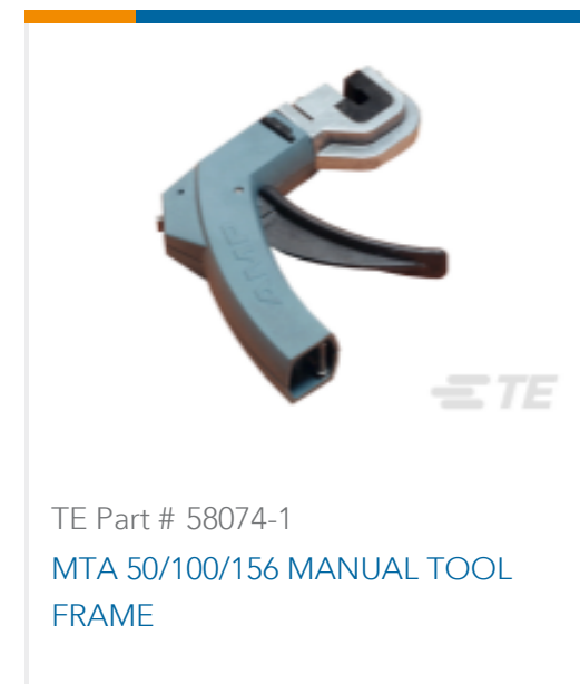
TE Part # 58074-1 MTA 50/100/156 MANUAL TOOL FRAME