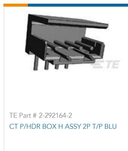
TE Part # 2-292164-2 CT P/HDR BOX H ASSY 2P T/P BLU