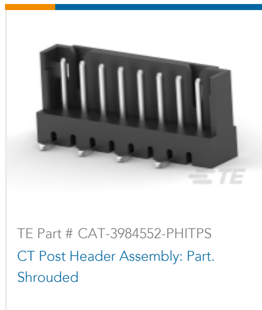
TE Part # CAT-3984552-PHITPS CT Post Header Assembly: Part. Shrouded