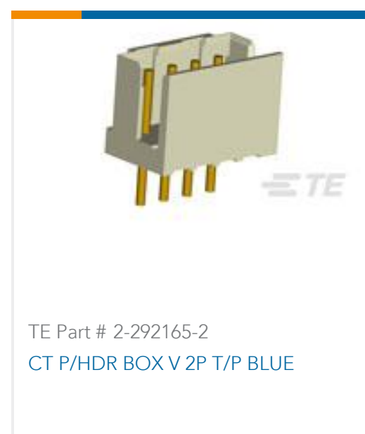
TE Part # 2-292165-2 CT P/HDR BOX V 2P T/P BLUE