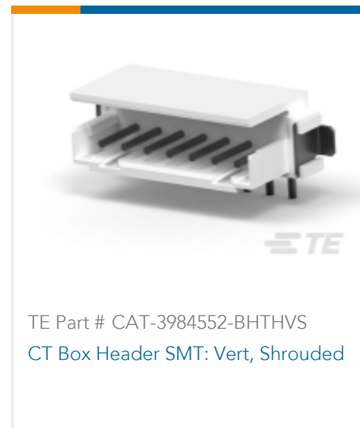
TE Part # CAT-3984552-BHTHVS CT Box Header SMT: Vert, Shrouded