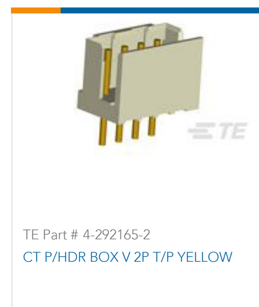
TE Part # 4-292165-2 CT P/HDR BOX V 2P T/P YELLOW