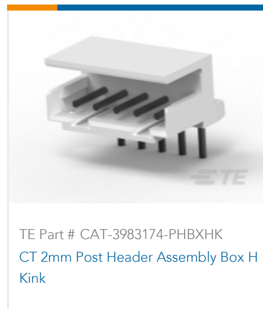
TE Part # CAT-3983174-PHBXHK CT 2mm Post Header Assembly Box H Kink