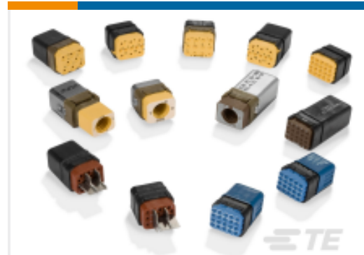
TE Part #ZPF000000000148762 DMC-M 99-04 AN (=33537-P0000)