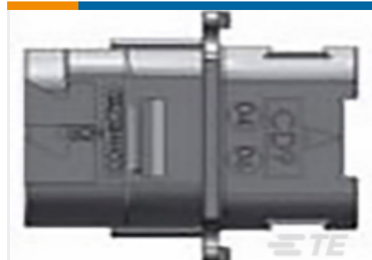
TE Part #ZPF000000000148912 DMC-MD 26 A-T