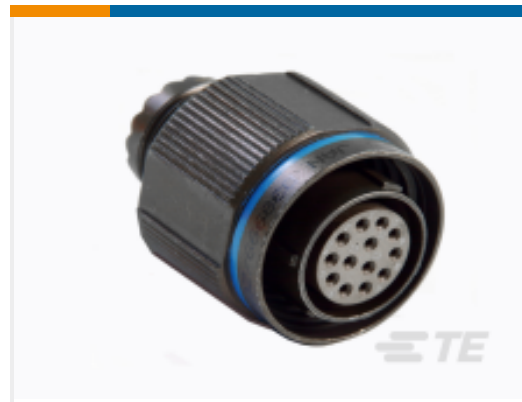
TE Part #YACT26MA98SEV00100 STRAIGHT PLUG