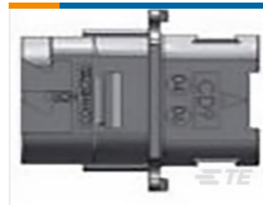
TE Part #ZPF000000000146309 DMC-MD 26 G-K-T