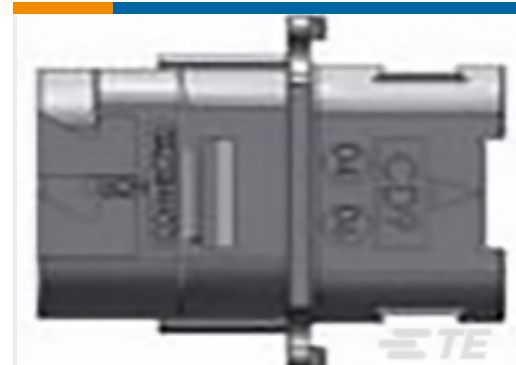
TE Part #ZPF000000000146308 DMC-MD 26 F-K-T