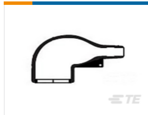
TE Part #EF9981-000 222K121-25L/225-0