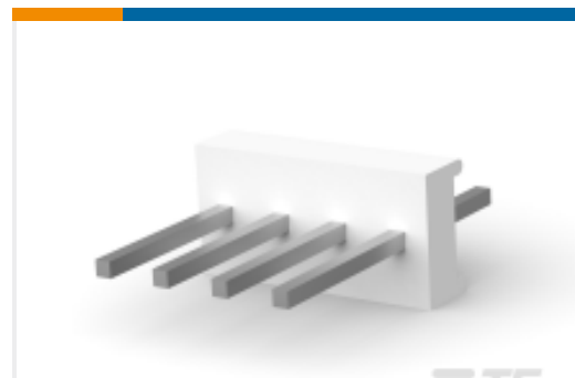
TE Part #640456-9 Polyester Vertical PCB Header: 2.54 mm, Unshrouded, No Mating Alignment