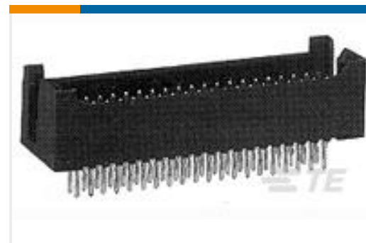
TE Part #1-102567-1 20 MODII 2PC HDR DR SHRD .100