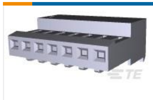
TE Part #3-640441-7 07P MTA100 CONN ASSY WHT