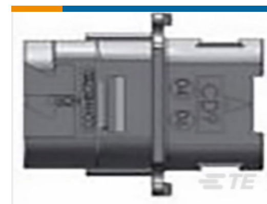
TE Part #ZPF000000000146309 DMC-MD 26 G-K-T