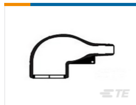
TE Part #EF9981-000 222K121-25L/225-0