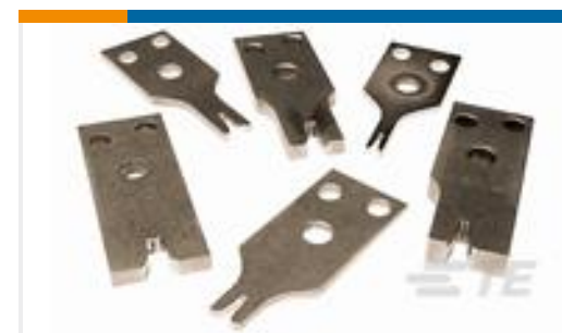
TE Part #6-2119784-0 CRIMPER INSULATION O PREMIUM