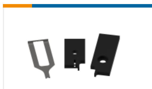
TE Part #2119791-9 DEPRESSOR, WIRE