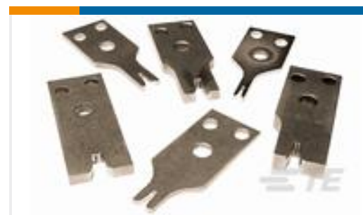
TE Part #5-1633730-0 CRIMPER, WIRE F.120F