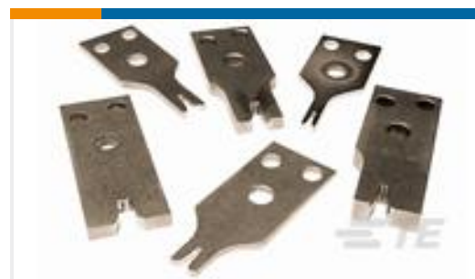
TE Part #4-1633962-0 CRIMPER, INSULATION F PREMIUM