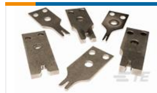
TE Part #2-456402-4 CRIMPER WIRE .055