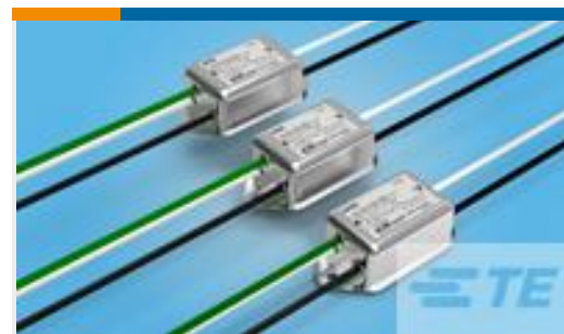
TE Part #8-1609095-9 2FB3=F8361