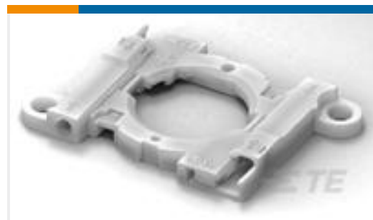
TE Part #2174024-1 LUMAWISE LED HOLDER, TYPE NL2