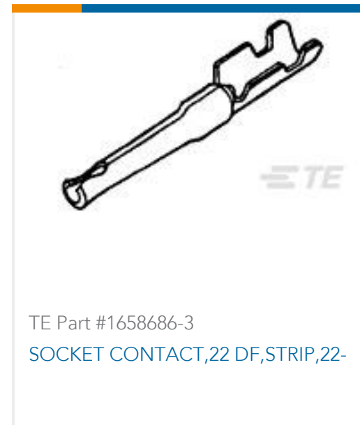
TE Part #1658686-3 SOCKET CONTACT,22 DF,STRIP,22-