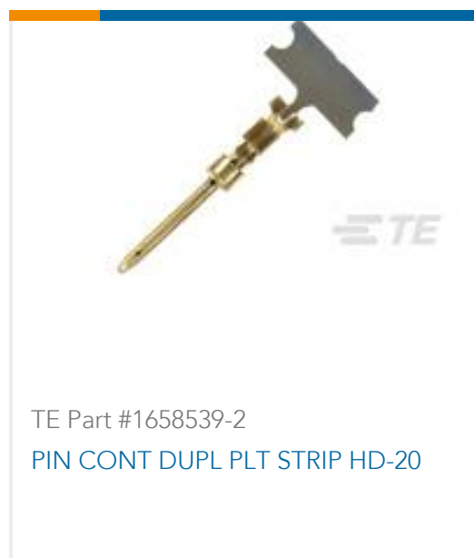
TE Part #1658539-2 PIN CONT DUPL PLT STRIP HD-20