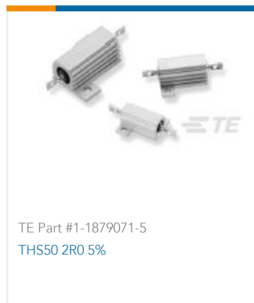
TE Part #1-1879071-5 THS50 2R0 5%