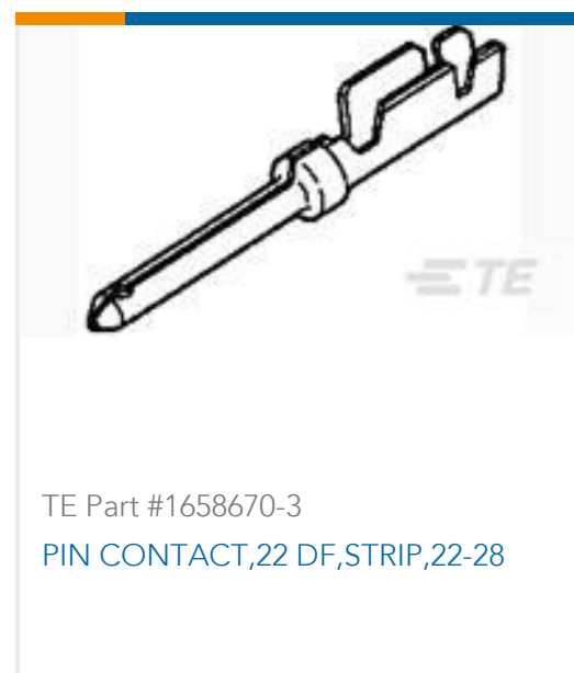
TE Part #1658670-3 PIN CONTACT,22 DF,STRIP,22-28