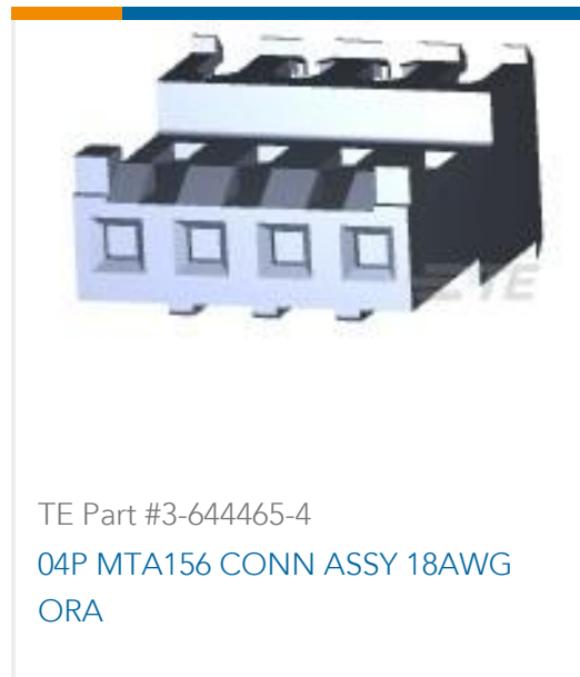
TE Part #3-644465-4 04P MTA156 CONN ASSY 18AWG ORA