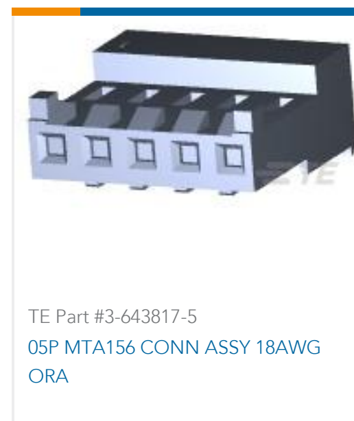
TE Part #3-643817-5 05P MTA156 CONN ASSY 18AWG ORA