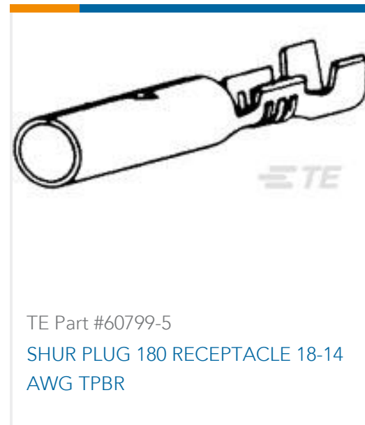
TE Part #60799-5 SHUR PLUG 180 RECEPTACLE 18-14 AWG TPBR