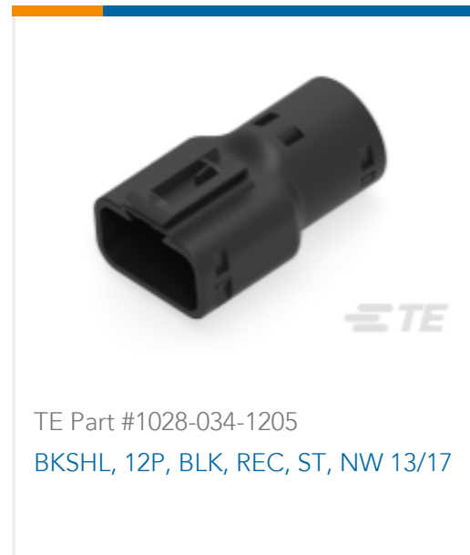
TE Part #1028-034-1205 BKSHL, 12P, BLK, REC, ST, NW 13/17