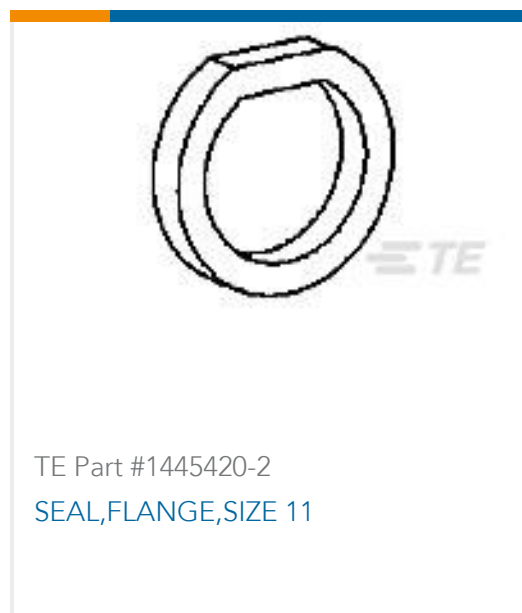
TE Part #1445420-2 SEAL,FLANGE,SIZE 11