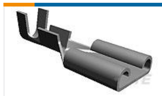
TE Part #42510-1 250 FASTON REC 22-18 AWG BR