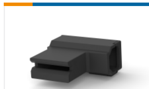
TE Part #1969657-1 250 FASTON HSG.,FLAG,REC.,1 POS, BLACK