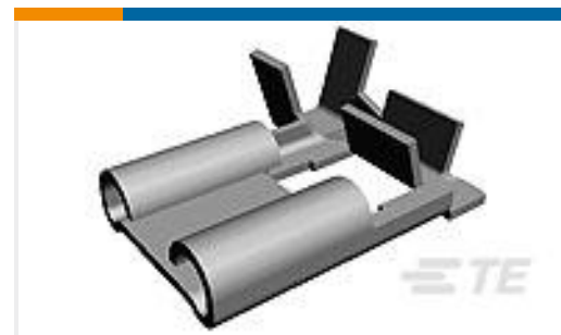
TE Part #63012-2 250 FASTON FLAG REC 18-14 AWG TPBR