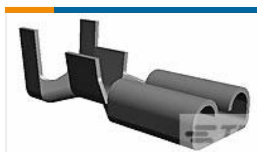
TE Part #60487-2 187 FASTON REC 18-16 AWG TPBR