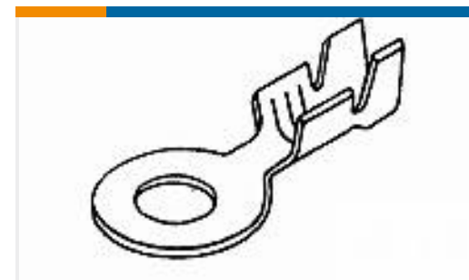
TE Part #42722-1 RING TONGUE 12-10 AWG BR