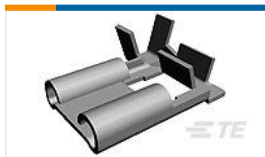
TE Part #62814-1 250 FASTON FLAG REC 22-18 AWG BR