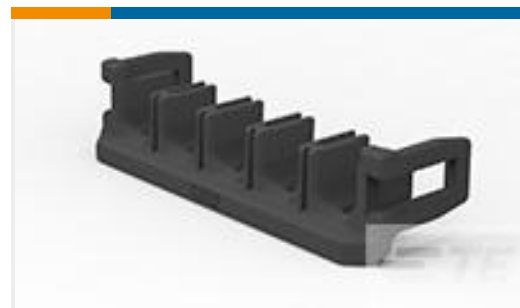
TE Part #1971777-5 PTL TPA HIGH TEMP 1 x 5 BLACK