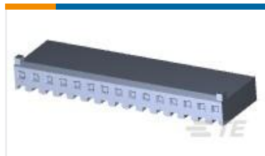
TE Part #1-770849-5 15P SL156 HSG W/LOC RAMP W/TBS