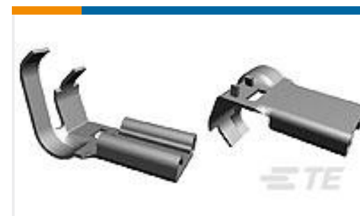
TE Part #1742543-1 250 FASTON,FLAG,REC.,18-12 AWG, NPST