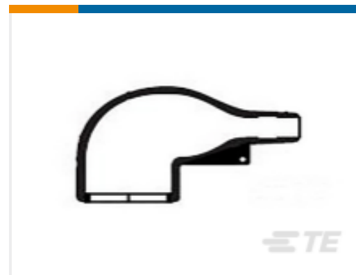
TE Part #EF9981-000 222K121-25L/225-0