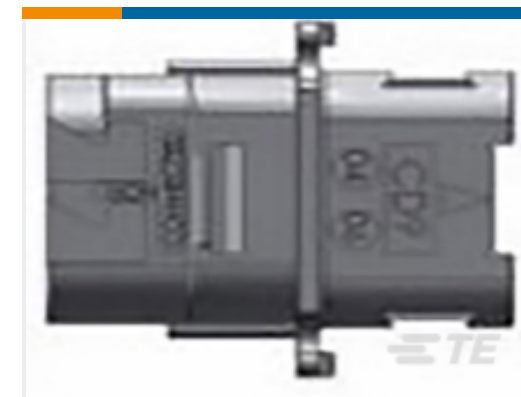
TE Part #ZPF000000000146309 DMC-MD 26 G-K-T