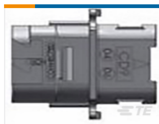
TE Part #ZPF000000000146308 DMC-MD 26 F-K-T