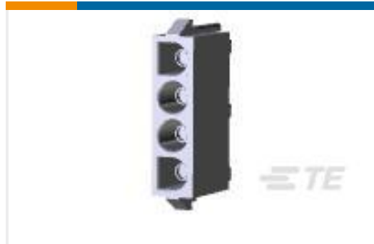
TE Part #643416-1 04P UMNL HDR ASSY POL 94VO