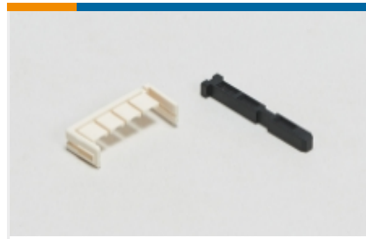
Rectangular Connector Keying Plugs(3)