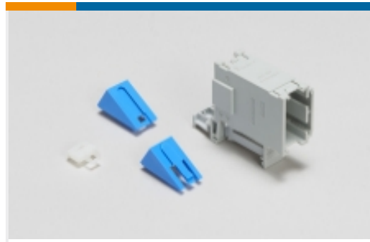
Rectangular Connector Adapters(7)