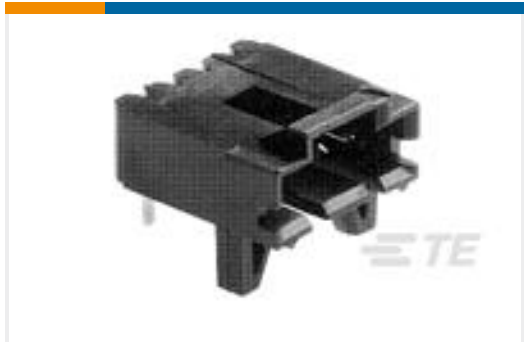
TE Part #5-103672-9 10 MTE HDR SRRA LATCH W/HLDWN