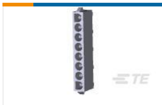
TE Part #643410-1 08P UMNL PIN HDR ASSY POL 94VO