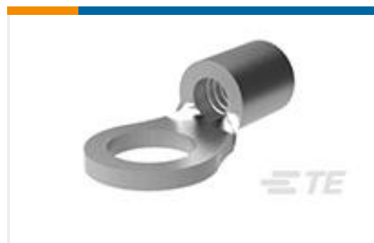
TE Part #2-324955-1 TERMINAL,SOLIS R 16-14 8