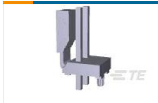
TE Part #3-644615-2 02P MTA156 POL HDR ASSY LF