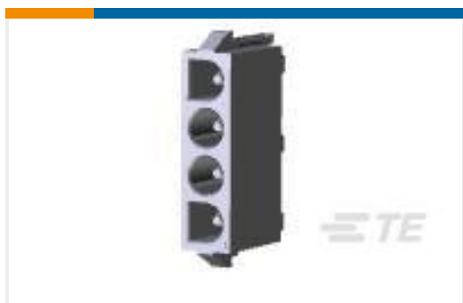
TE Part #641968-3 04P UMNL PIN HDR ASSY POL 94VO