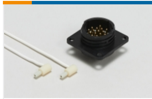
Circular Power Connectors(2)