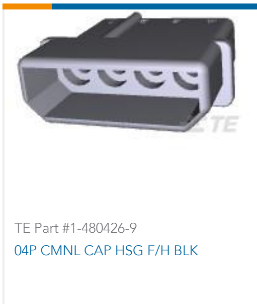
TE Part #1-480426-9 04P CMNL CAP HSG F/H BLK