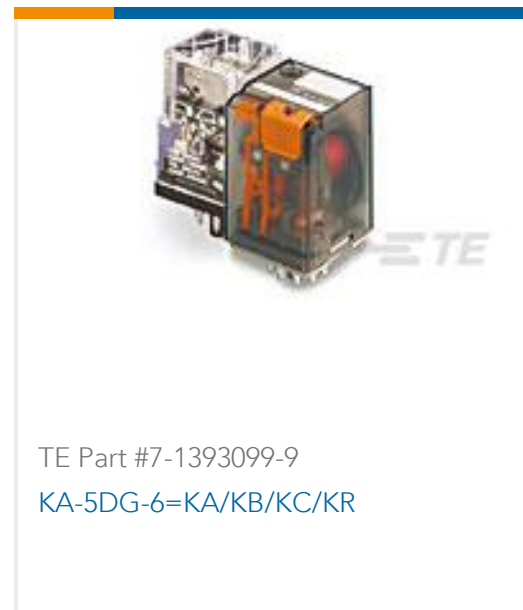
TE Part #7-1393099-9 KA-5DG-6=KA/KB/KC/KR