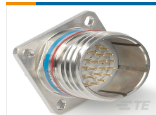
TE Part #YDTS20W25-35BAV001 D38999: Square Flange, 25-35 insert