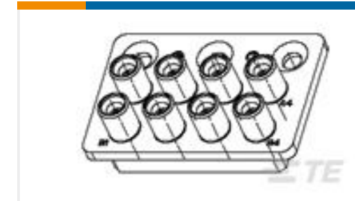
TE Part #1996706-1 8 POS VITA 67.2 RF MODULE, BACKPLANE,SMPM