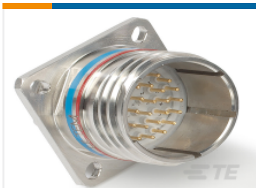
TE Part #YDTS20W13-35BNV001 RECP ASSY