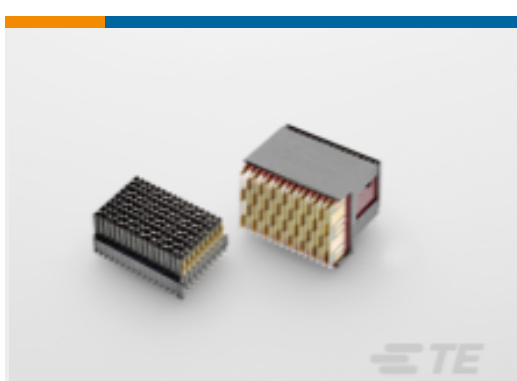
TE Part #2332817-1 Vert RCPT Left End Half Multigig RT 3