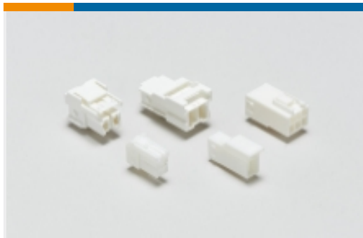
Rectangular Power Connectors(109)