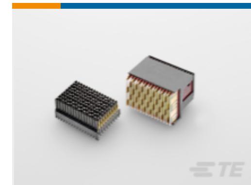
TE Part #2302791-1 VERTRECASSY,CENTER,RTM, MULTIGIG RT3