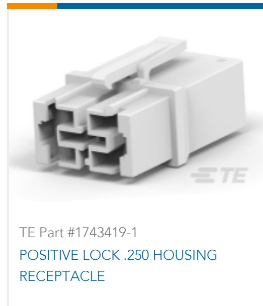
TE Part #1743419-1 POSITIVE LOCK .250 HOUSING RECEPTACLE