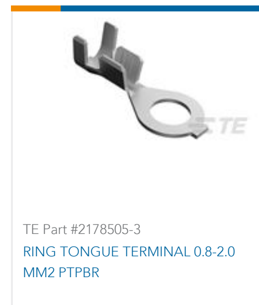
TE Part #2178505-3 RING TONGUE TERMINAL 0.8-2.0 MM2 PTPBR