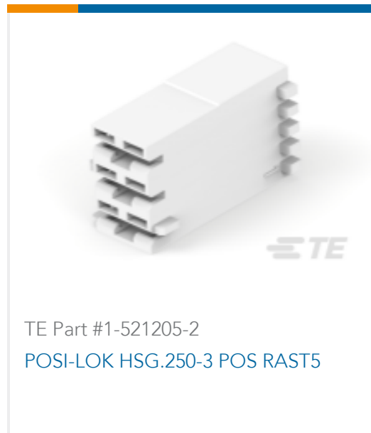
TE Part #1-521205-2 POSI-LOK HSG.250-3 POS RAST5