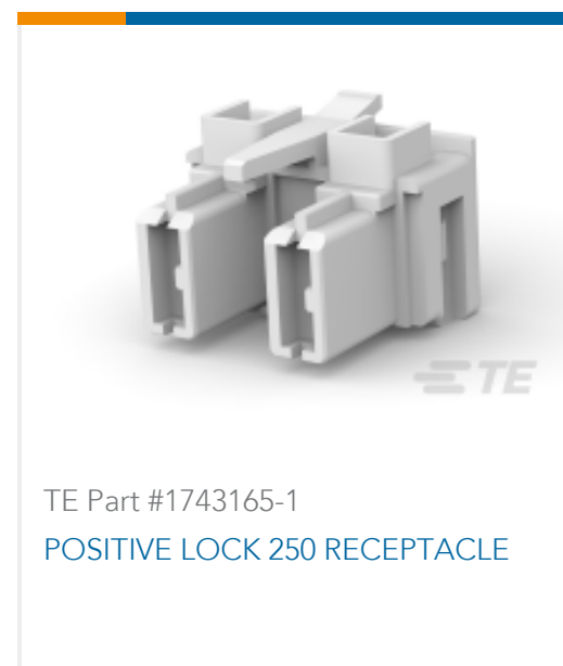
TE Part #1743165-1 POSITIVE LOCK 250 RECEPTACLE