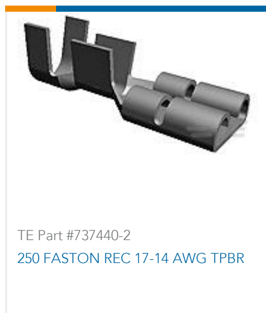
TE Part #737440-2 250 FASTON REC 17-14 AWG TPBR