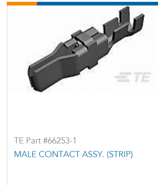
TE Part #66253-1 MALE CONTACT ASSY. (STRIP)