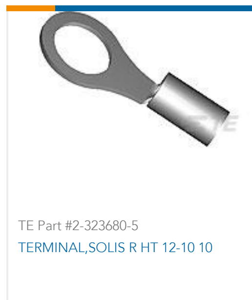
TE Part #2-323680-5 TERMINAL,SOLIS R HT 12-10 10