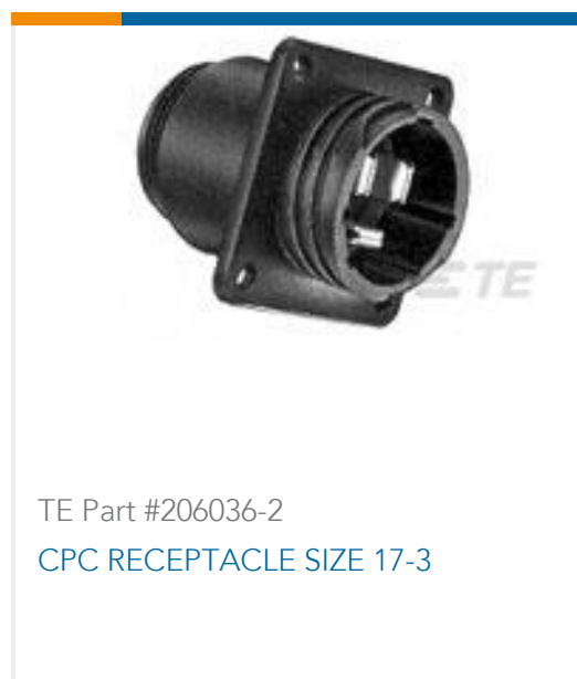
TE Part #206036-2 CPC RECEPTACLE SIZE 17-3