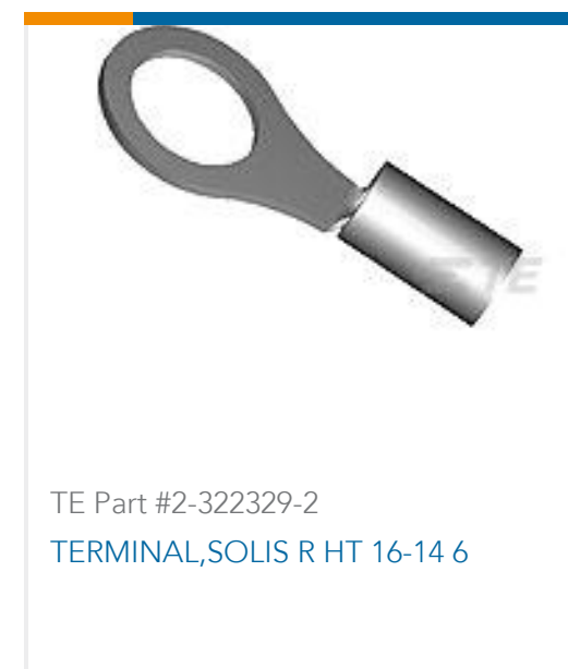
TE Part #2-322329-2 TERMINAL,SOLIS R HT 16-14 6