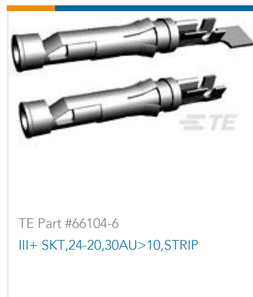
TE Part #66104-6 III+ SKT,24-20,30AU>10,STRIP