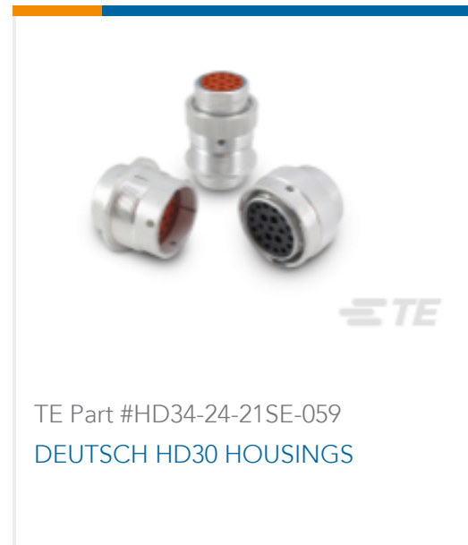
TE Part #HD34-24-21SE-059 DEUTSCH HD30 HOUSINGS