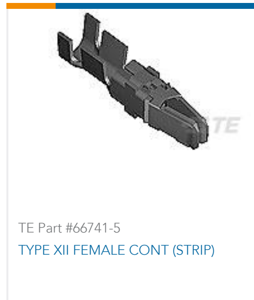
TE Part #66741-5 TYPE XII FEMALE CONT (STRIP)