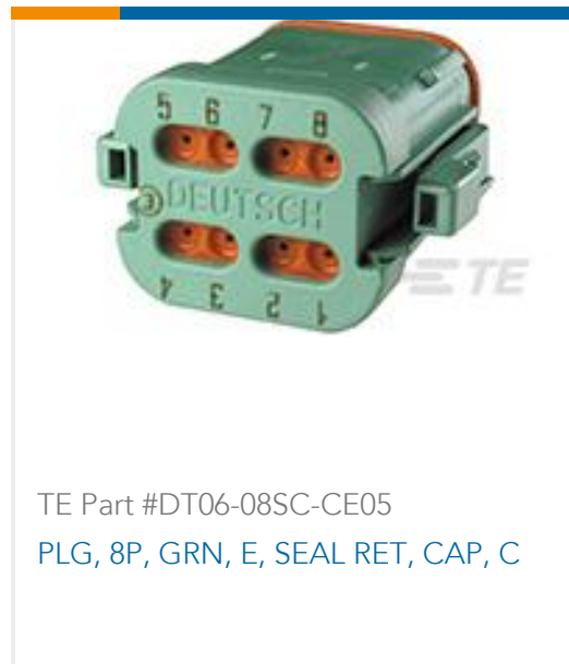
TE Part #DT06-08SC-CE05 PLG, 8P, GRN, E, SEAL RET, CAP, C