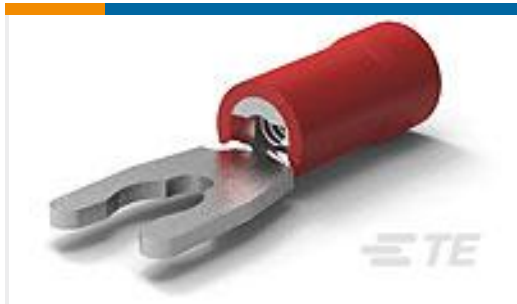
TE Part #53240-1 PG SP SPD 22-16COMM22-18MIL 6