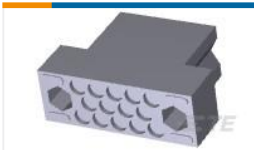
TE Part #201355-1 MALE BLOCK 14 PL.