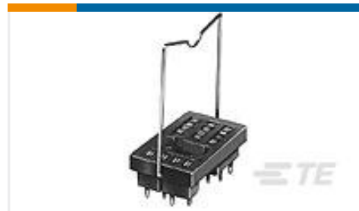
TE Part #3-1393159-5 20C249=SPRING,HOLD-DOWN,R10,.0