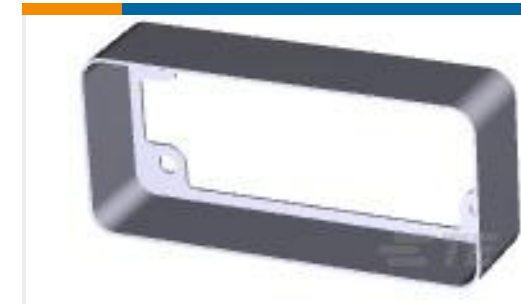
TE Part #202119-2 PIN HOOD