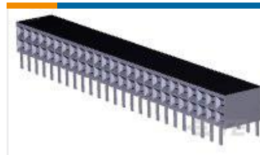
TE Part #535512-7 50 MODII HORZ DR CE