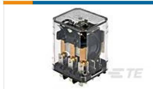
TE Part #4-1393117-2 KUP-11D11-24=KU