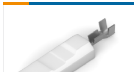
TE Part #521368-2 ULTRA POD: Straight, Receptacle Assembly, Tin Plated, 0.25 inch