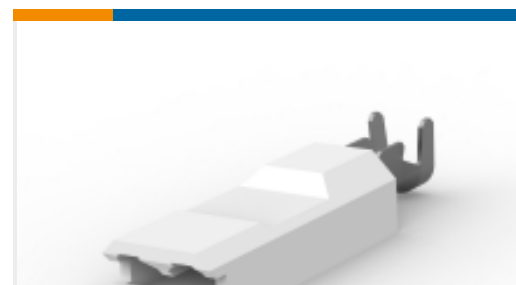
TE Part #521284-2 ULTRA POD: Straight, Receptacle Assembly, Tin Plated, .187 inch