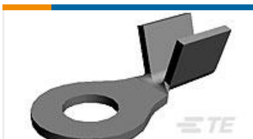
TE Part #42111-3 RING TONGUE TERMINAL 18-14 AWG TPBR