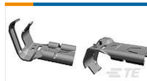
TE Part #63445-4 250 FASTON FLAG REC 18-12 AWG TPBR