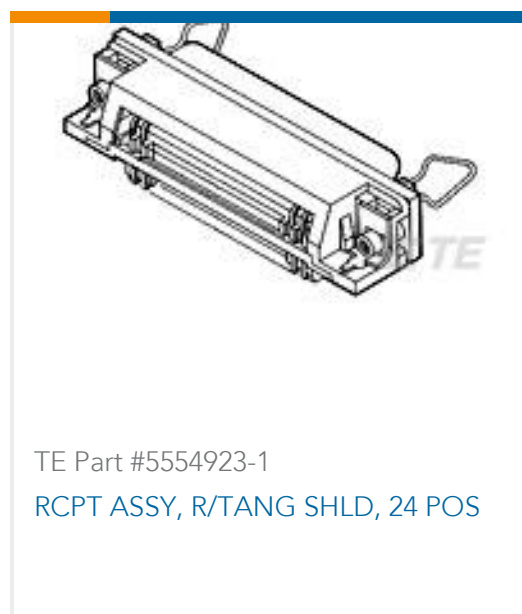
TE Part #5554923-1 RCPT ASSY, R/TANG SHLD, 24 POS