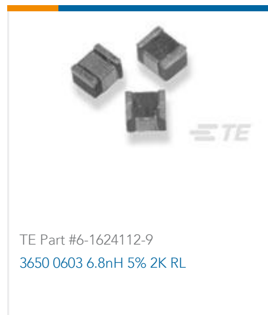
TE Part #6-1624112-9 3650 0603 6.8nH 5% 2K RL