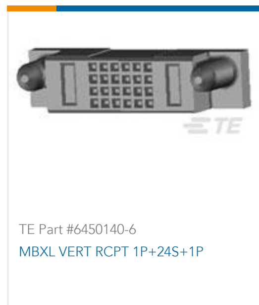
TE Part #6450140-6 MBXL VERT RCPT 1P+24S+1P