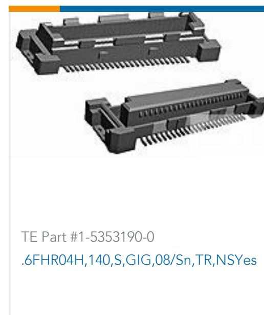
TE Part #1-5353190-0 .6FHR04H,140,S,GIG,08/Sn,TR,NSYes