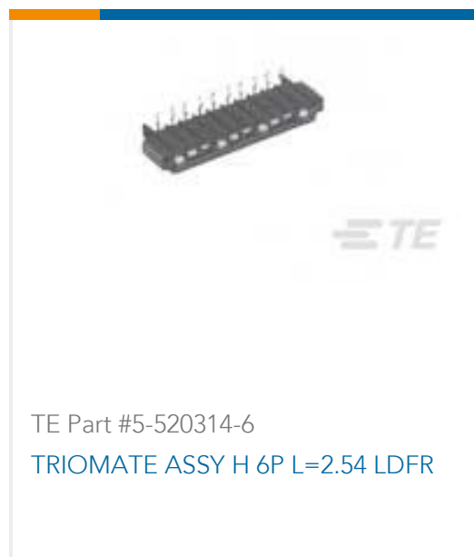
TE Part #5-520314-6 TRIOMATE ASSY H 6P L=2.54 LDFR