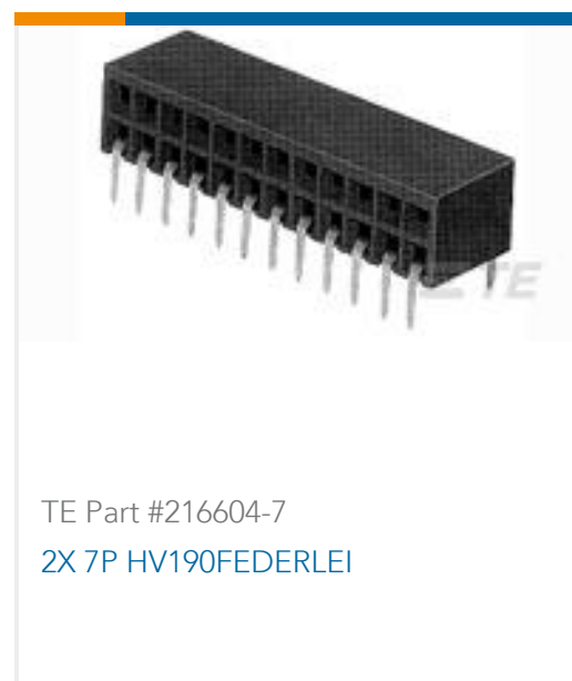
TE Part #216604-7 2X 7P HV190FEDERLEI