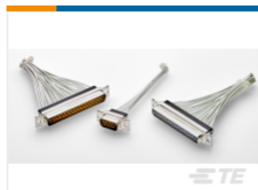
TE Part #2335890-1 AMPLIMITE SZ 1 RECEP 9 POS, ST STL SHEL