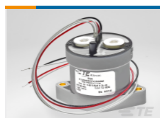
TE Part #5-1618413-0 EV600HVANM = CONTACTOR, SPST-NO 12V COIL