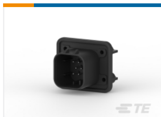
TE Part #1-776180-2 AMPSEAL PCB Horizontal Headers