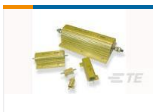
TE Part #4-1630186-0 HSA50 R015 5%