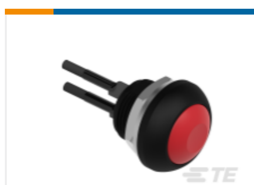
TE Part #2329386-2 PN OFF/ON FC RED M1 TERM IP68 500MM LHS