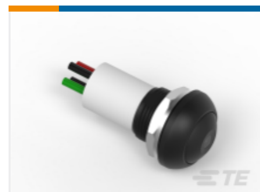
TE Part #2329388-1 PB OFF/ON FC BLK M1 TERM WHI LED IP68 50