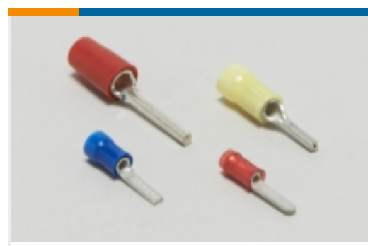
Crimp Wire Pins, Tabs &amp; Ferrules(25)