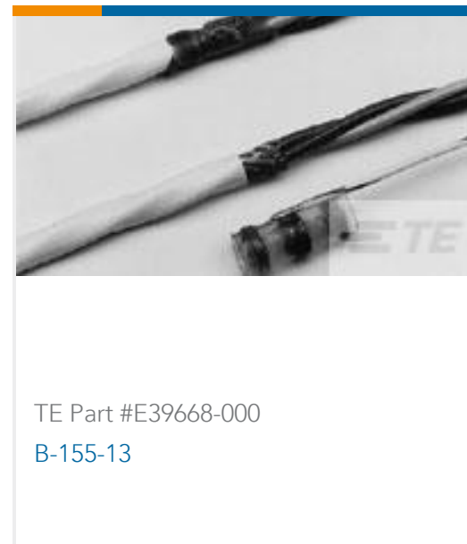
TE Part #E39668-000 B-155-13