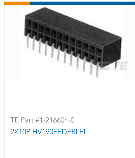
TE Part #1-216604-0 2X10P HV190FEDERLEI