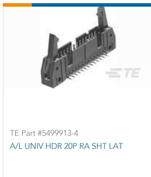
TE Part #5499913-4 A/L UNIV HDR 20P RA SHT LAT