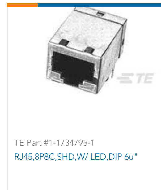
TE Part #1-1734795-1 RJ45,8P8C,SHD,W/ LED,DIP 6u"