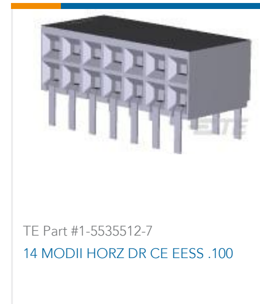
TE Part #1-5535512-7 14 MODII HORZ DR CE EESS .100