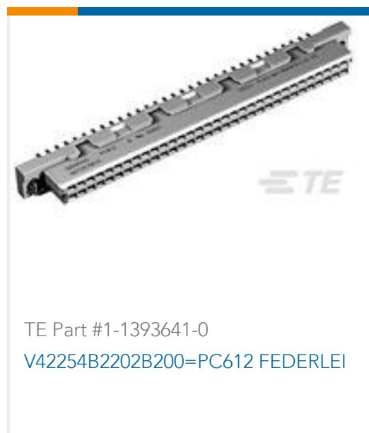
TE Part #1-1393641-0 V42254B2202B200=PC612 FEDERLEI