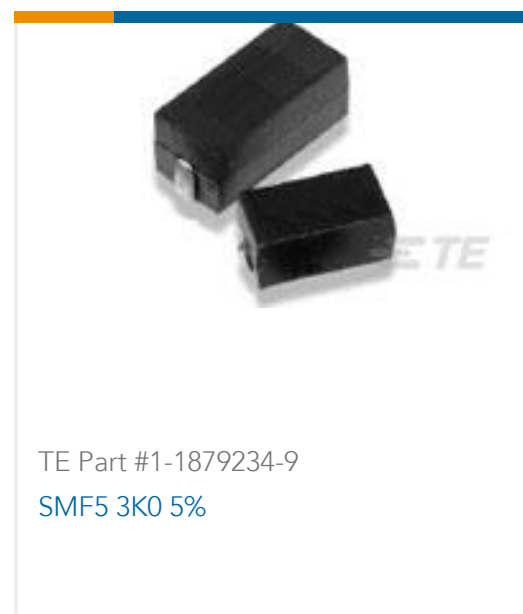
TE Part #1-1879234-9 SMF5 3K0 5%