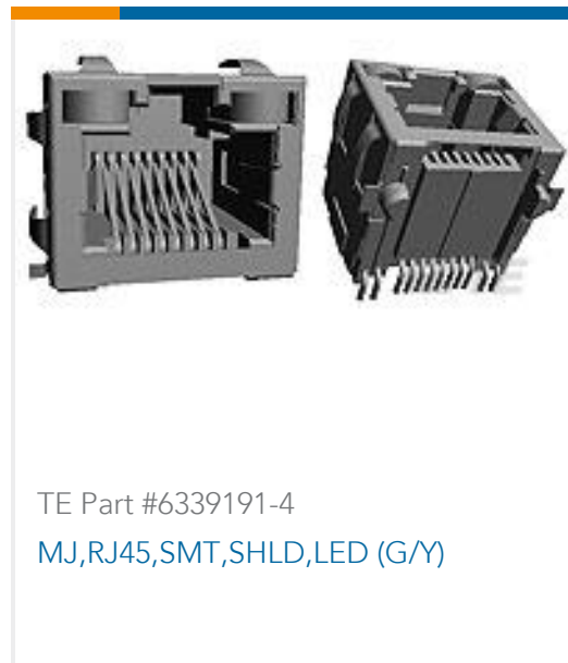
TE Part #6339191-4 MJ,RJ45,SMT,SHLD,LED (G/Y)