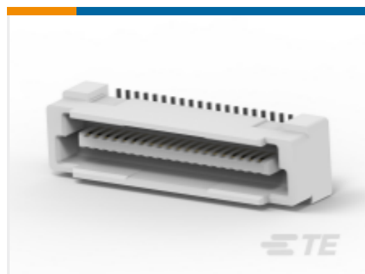
TE Part # CAT-313-PCB40 Free Height Plug Connector: Board-Board, Vertical, 40, 0.8mm