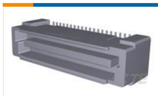
TE Part # 1735434-1 0.8FH,P08H.5,040,08/Sn,TR,KT