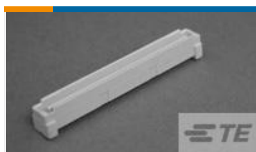
TE Part #2-5177986-1 0.8FH,P07H.5,040,08/Sn,TR,SC