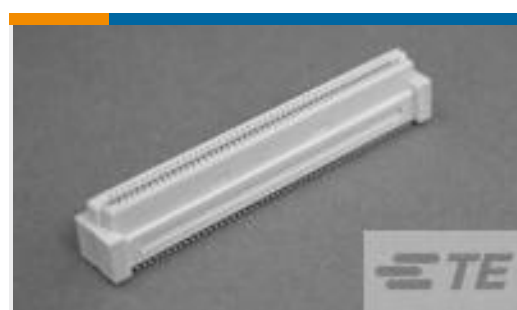
TE Part #5-5179180-3 0.8FH,R09H.5,080,08/Sn,TR,SC