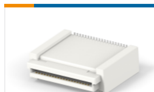
TE Part #2271041-1 0.8FH,R19H.5,040,30/SN,TR,SC