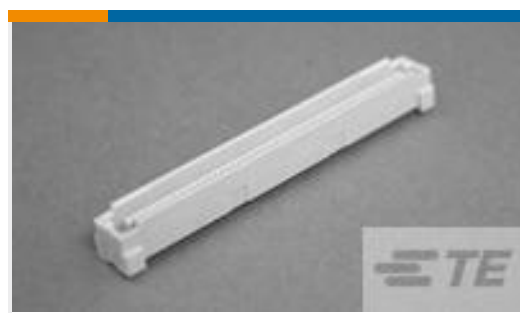
TE Part # 5179029-1 0.8FH,P06H.5,040,08/Sn,TU