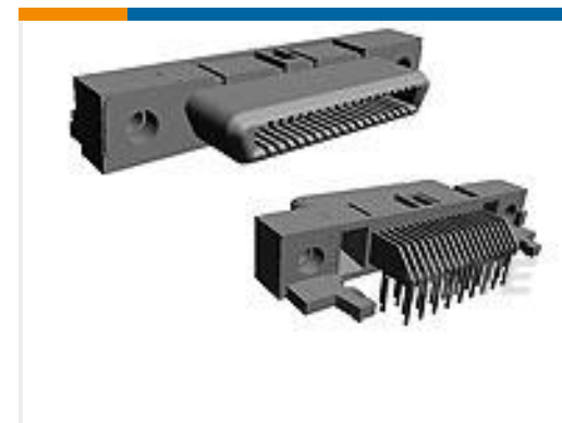
TE Part #5796055-1 68 CHAMP R/A ASSY,LC