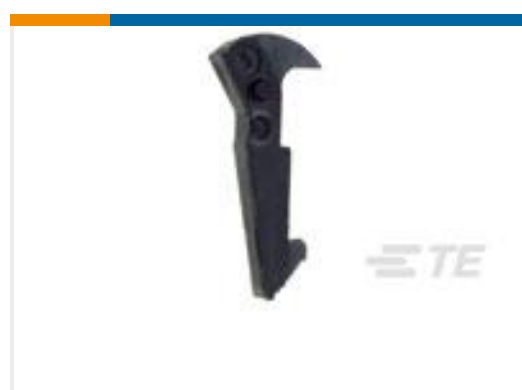
TE Part #102320-1 UNIVERSAL HEADER LATCH