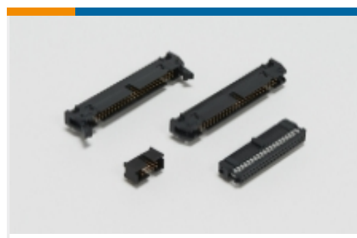
Ribbon Cable Connectors(525)