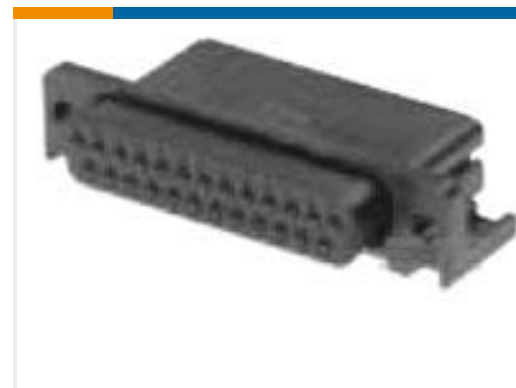
TE Part #747461-1 25 APFL RCPT RA 590