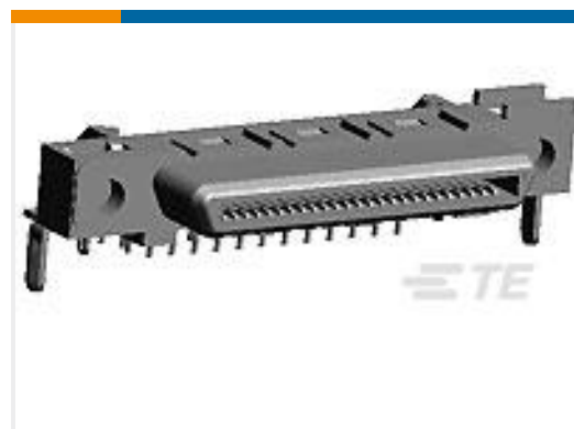
TE Part #6658751-1 .8MM CHAMP, 50 POS, RCPT ASSY