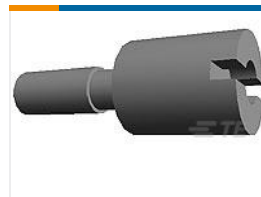
TE Part #787004-3 .8MM SCREWLOCK BRDMT,BULK