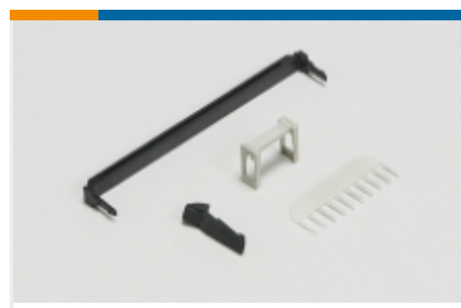
Ribbon Connector Accessories(13)