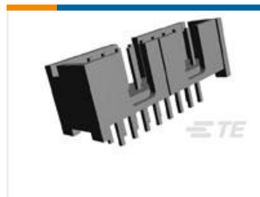
TE Part #103308-8 040 LOPRO HDR SP 15DP