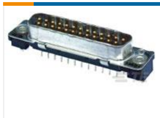
TE Part #3-338309-2 9POS.HD20 PLUG ASSY