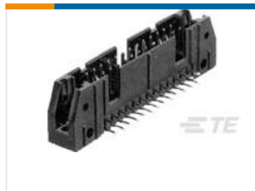
TE Part #5102159-8 A/L UNIV HDR 34P RA