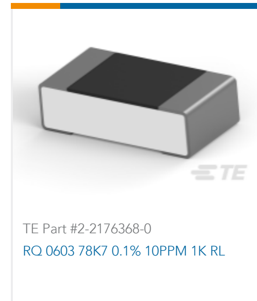
TE Part #2-2176368-0 RQ 0603 78K7 0.1% 10PPM 1K RL