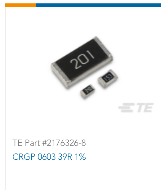
TE Part #2176326-8 CRGP 0603 39R 1%