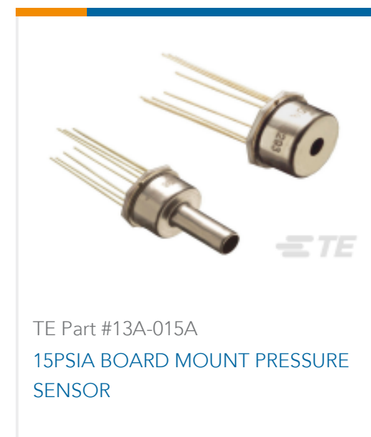
TE Part #13A-015A 15PSIA BOARD MOUNT PRESSURE SENSOR