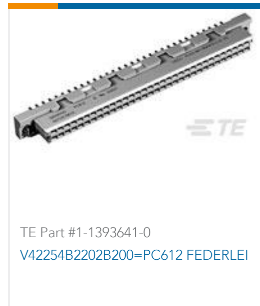
TE Part #1-1393641-0 V42254B2202B200=PC612 FEDERLEI