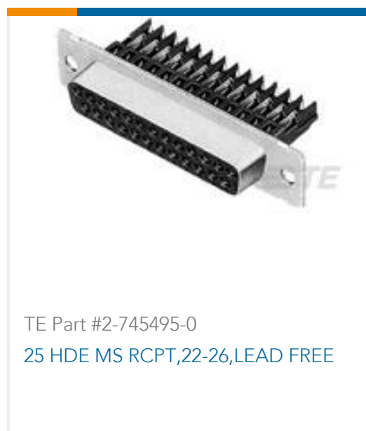
TE Part #2-745495-0 25 HDE MS RCPT,22-26,LEAD FREE