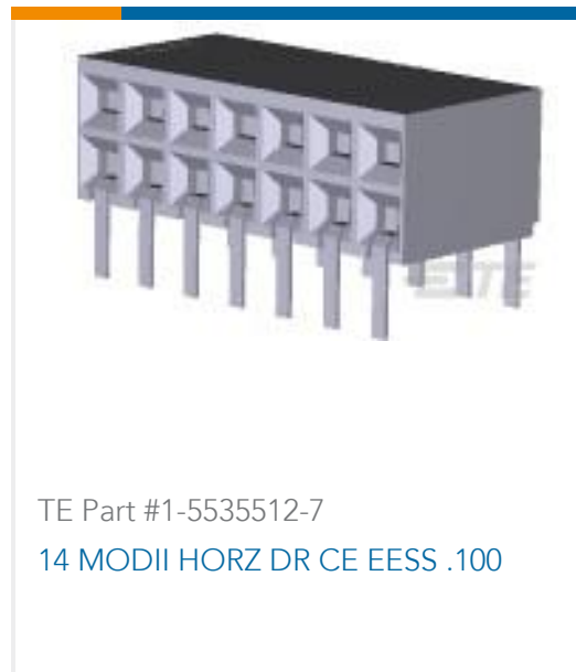
TE Part #1-5535512-7 14 MODII HORZ DR CE EESS .100