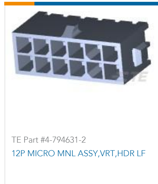
TE Part #4-794631-2 12P MICRO MNL ASSY,VRT,HDR LF