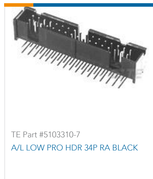
TE Part #5103310-7 A/L LOW PRO HDR 34P RA BLACK