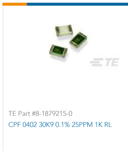
TE Part #8-1879215-0 CPF 0402 30K9 0.1% 25PPM 1K RL