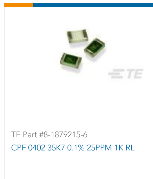
TE Part #8-1879215-6 CPF 0402 35K7 0.1% 25PPM 1K RL