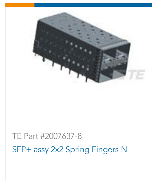
TE Part #2007637-8 SFP+ assy 2x2 Spring Fingers N