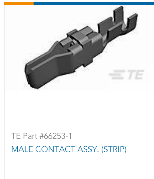
TE Part #66253-1 MALE CONTACT ASSY. (STRIP)