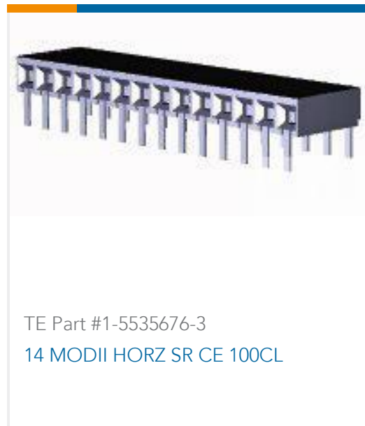
TE Part #1-5535676-3 14 MODII HORZ SR CE 100CL