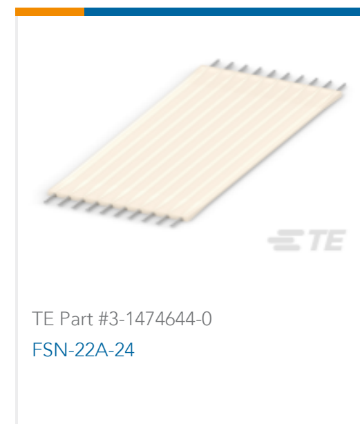
TE Part #3-1474644-0 FSN-22A-24