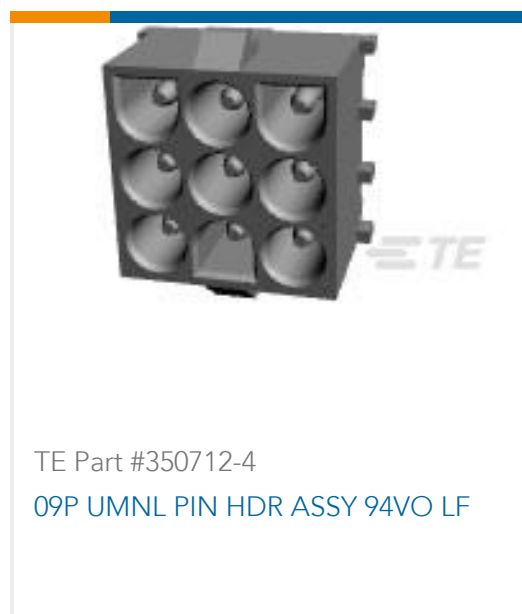
TE Part #350712-4 09P UMNL PIN HDR ASSY 94VO LF