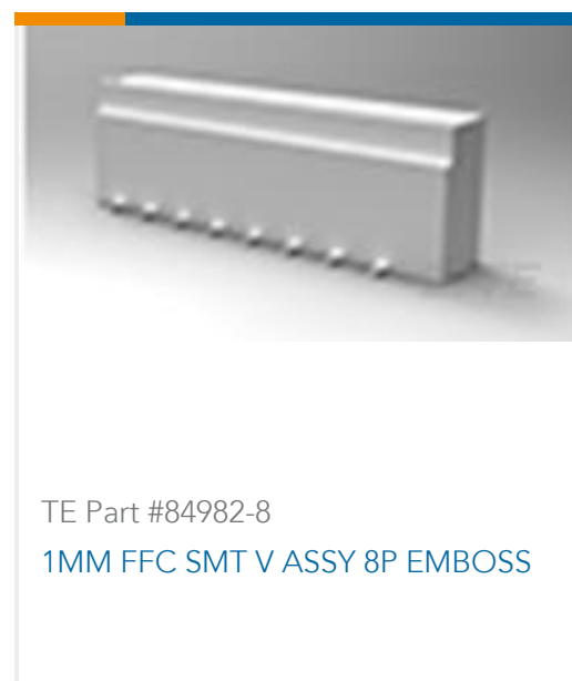
TE Part #84982-8 1MM FFC SMT V ASSY 8P EMBOSS