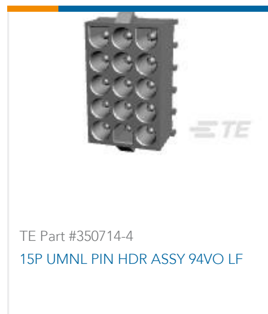
TE Part #350714-4 15P UMNL PIN HDR ASSY 94VO LF