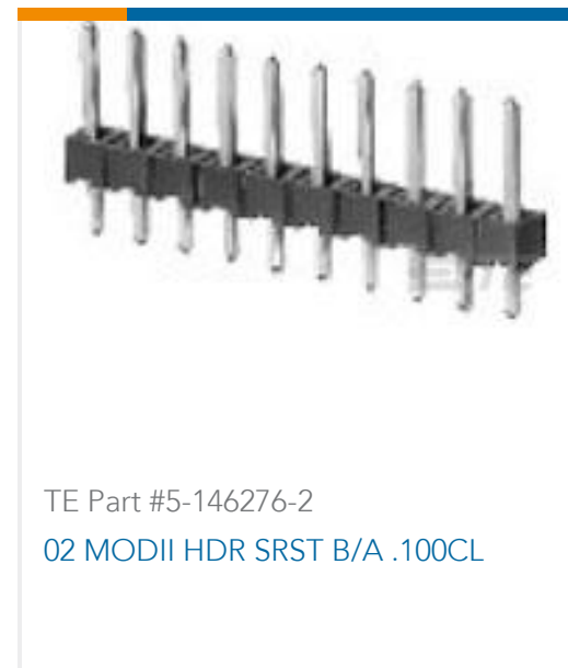
TE Part #5-146276-2 02 MODII HDR SRST B/A .100CL