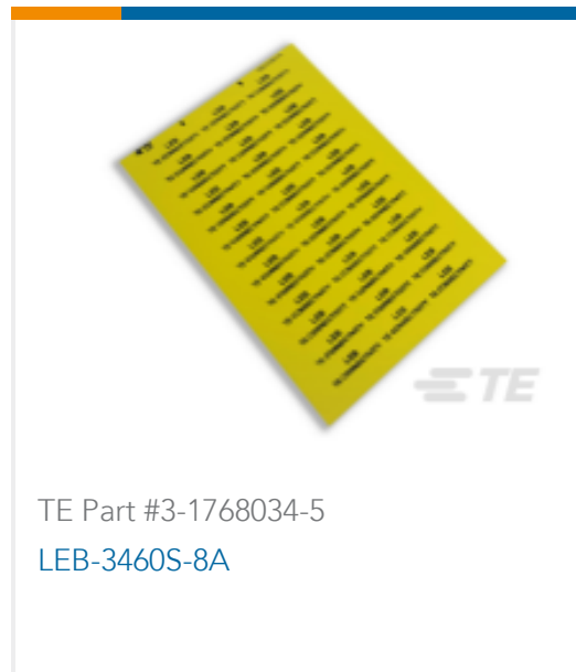
TE Part #3-1768034-5 LEB-3460S-8A