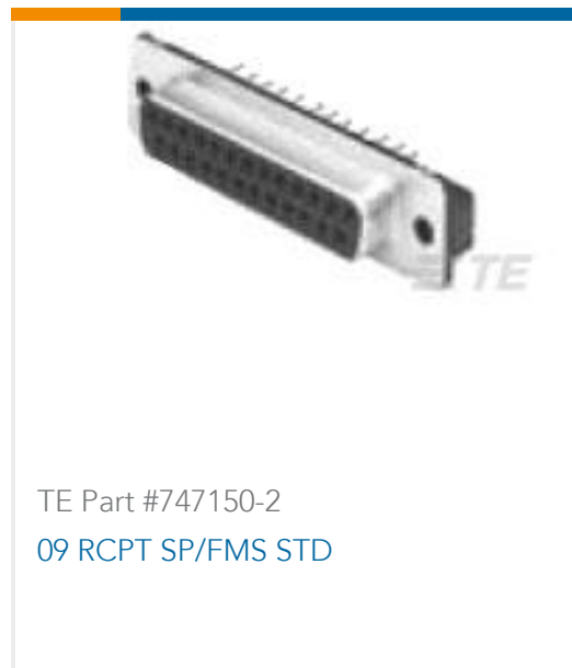
TE Part #747150-2 09 RCPT SP/FMS STD