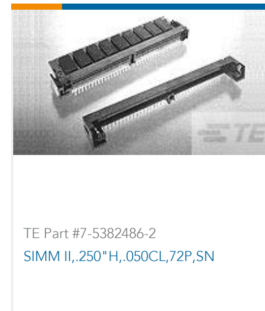
TE Part #7-5382486-2 SIMM II, .250\"H, .050CL, 72P, SN