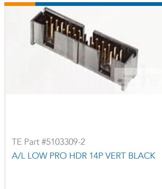
TE Part #5103309-2 A/L LOW PRO HDR 14P VERT BLACK