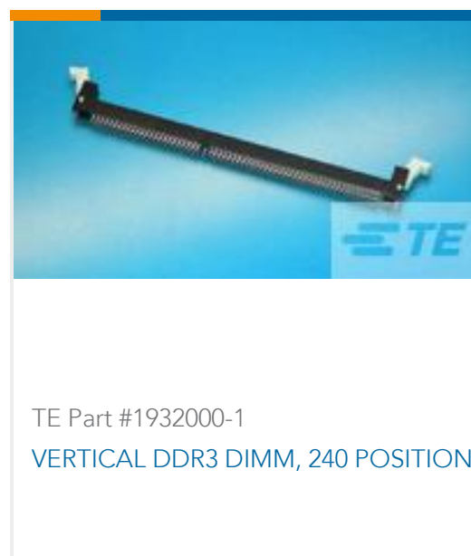
TE Part #1932000-1 VERTICAL DDR3 DIMM, 240 POSITION