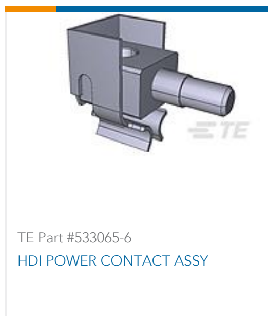
TE Part #533065-6 HDI POWER CONTACT ASSY