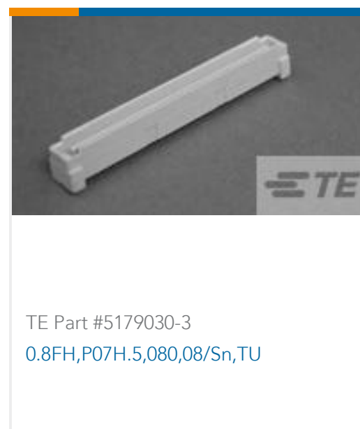
TE Part #5179030-3 0.8FH,P07H.5,080,08/Sn,TU