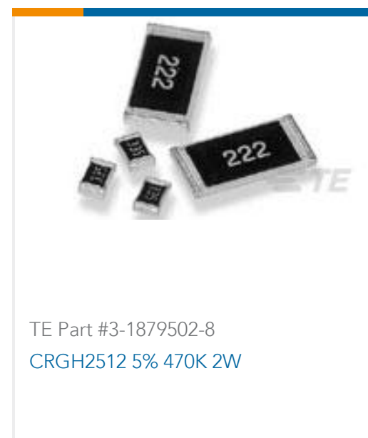
TE Part #3-1879502-8 CRGH2512 5% 470K 2W