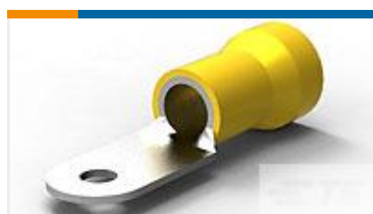
TE Part #52043 TERMINAL,R PG 4 10