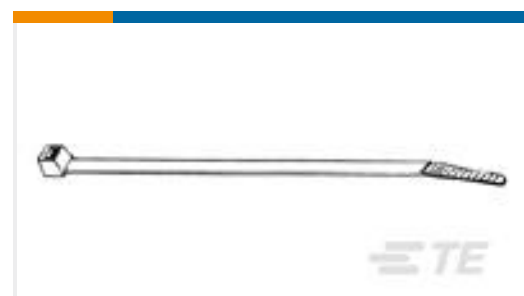
TE Part #1-604772-0 CABLE TIE, 8" L, BLACK, 100PK