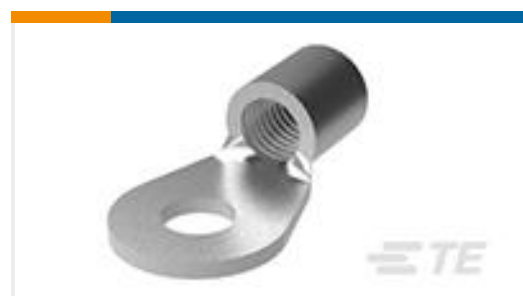
TE Part #35185 TERMINAL,SOLIS R 2 1/2