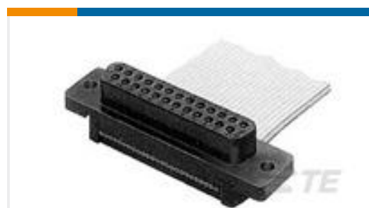
TE Part #1658614-3 15 POS HDF RCPT, AP, LEAD FREE