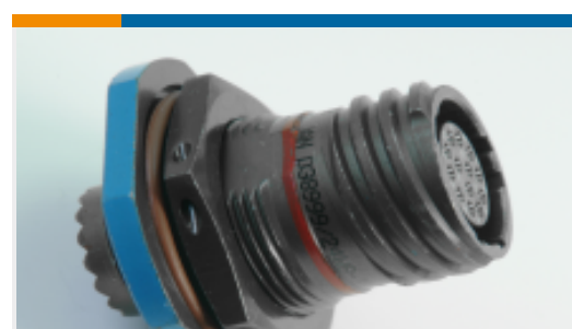
TE Part #YDTS24F13-35SNV001 RECP ASSY