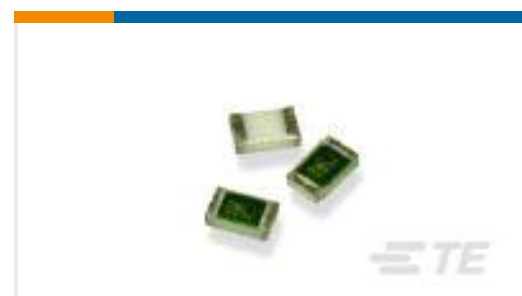
TE Part #7-1879061-4 CPF 0402 10K 0.1% 25PPM 5K RL