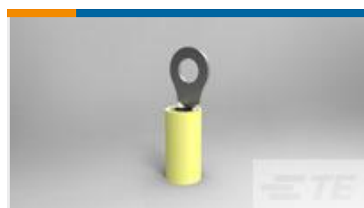
TE Part #54312-1 TERMINAL,PIDG R 26-24 10