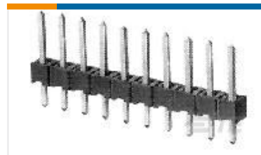
TE Part #4-103327-5 03 MODII HDR SRST B/A .100CL