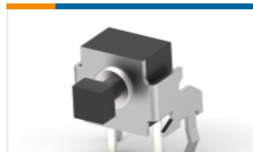
TE Part #1825968-2 FSMRACDAH=6.0mm R/A Tact W/SQ ACT. & HT