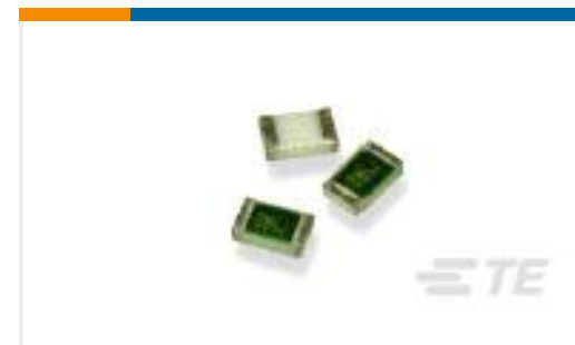
TE Part #3-1614884-3 CPF 0805 47R 0.1% 25PPM 1K RL