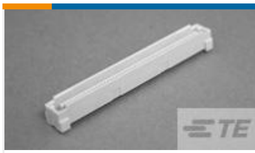
TE Part #5179029-5 0.8FH,P06H.5,120,08/Sn,TU