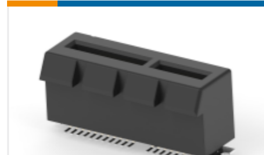
TE Part #2344054-1 PCIe Gen3.0 SMT type connecto,15u" Au