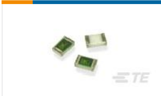
TE Part #4-1625868-1 RP 2A 0.25W 14R 0.1% 25PPM 1K RL