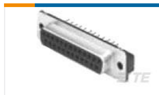
TE Part #1-5745967-0 25 RCPT SP/FMS INSRT