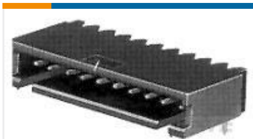
TE Part #5-102203-5 08 MODII HDR SRRA SHRD LF