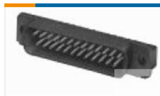
TE Part #5208007-2 HD-20 PLUG 15P VERT