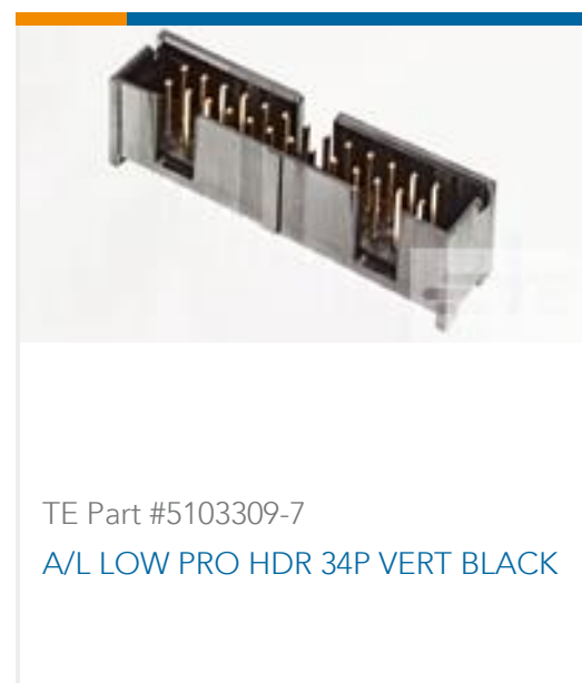
TE Part #5103309-7 A/L LOW PRO HDR 34P VERT BLACK