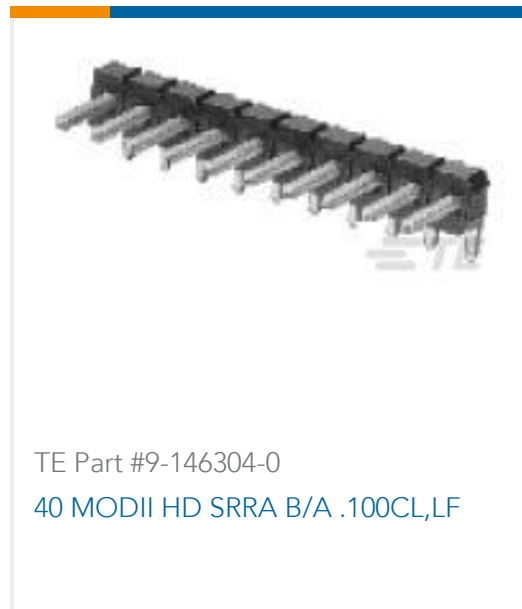
TE Part #9-146304-0 40 MODII HD SRRA B/A .100CL,LF