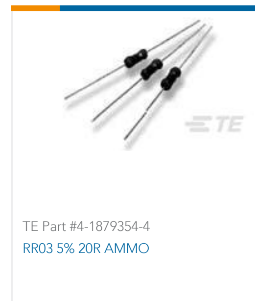
TE Part #4-1879354-4 RR03 5% 20R AMMO