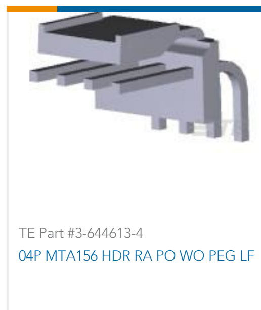
TE Part #3-644613-4 04P MTA156 HDR RA PO WO PEG LF