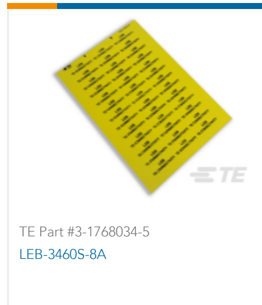
TE Part #3-1768034-5 LEB-3460S-8A