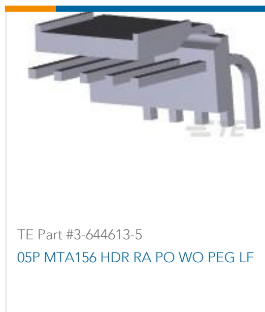
TE Part #3-644613-5 05P MTA156 HDR RA PO WO PEG LF