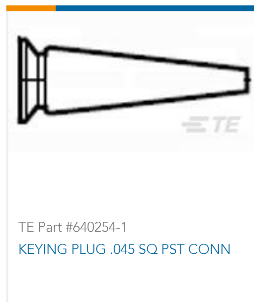
TE Part #640254-1 KEYING PLUG .045 SQ PST CONN