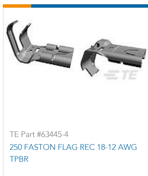
TE Part #63445-4 250 FASTON FLAG REC 18-12 AWG TPBR