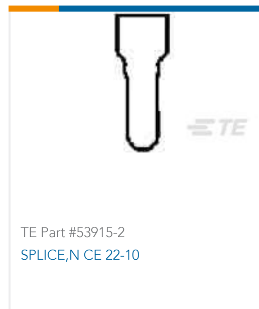
TE Part #53915-2 SPLICE,N CE 22-10