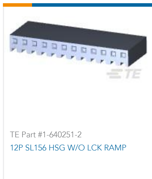
TE Part #1-640251-2 12P SL156 HSG W/O LCK RAMP