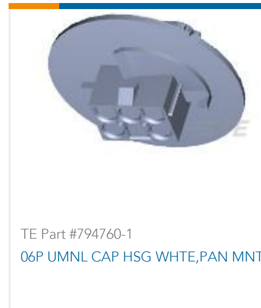
TE Part #794760-1 06P UMNL CAP HSG WHITE,PAN MNT