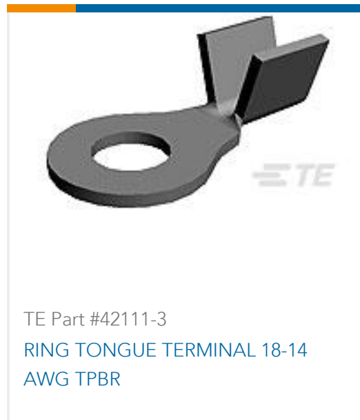
TE Part #42111-3 RING TONGUE TERMINAL 18-14 AWG TPBR