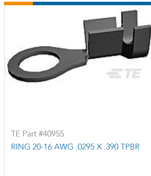
TE Part #40955 RING 20-16 AWG .0295 X .390 TPBR