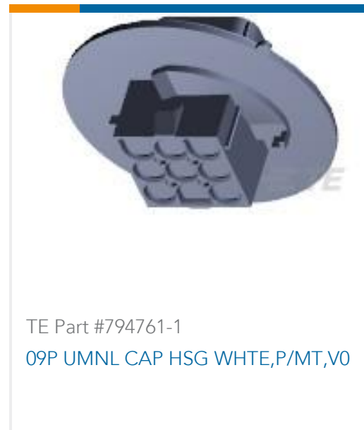
TE Part #794761-1 09P UMNL CAP HSG WHITE,P/MT,V0