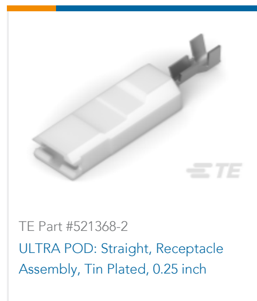
TE Part #521368-2 ULTRA POD: Straight, Receptacle Assembly, Tin Plated, 0.25 inch