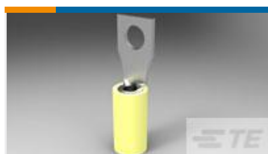
TE Part #2-327960-2 TERMINAL,PIDG RECT 12-10 6