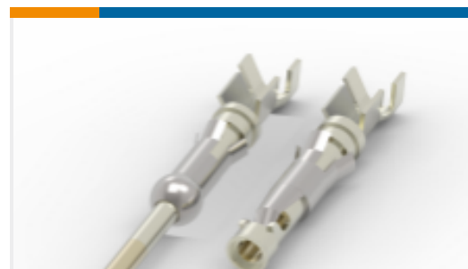
TE Part #66597-2 TYPE III CONTACTS STRIP