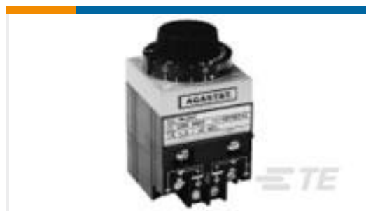
TE Part #1423162-7 7022AD=RLY,STD,OFF,2P,120VAC,5