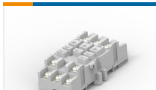
TE Part #2-1419106-5 27E893=SOCKET,KU,11,QC,POLY,NA-