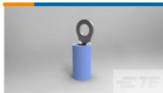
TE Part #50881-2 TERMINAL,PIDG R 16-14 6