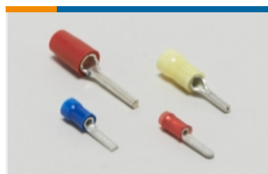
Crimp Wire Pins, Tabs & Ferrules(25)