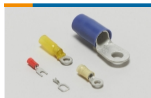
Ring Terminals & Spade Terminals(537)