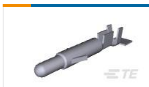
TE Part #350924-6 UMNL PIN 26-30 AUNI/PHBZ