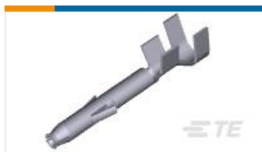
TE Part #1-794407-1 MINI UMNL SOK 20-16 AWG AU LF