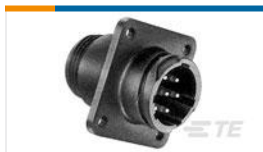
TE Part #213870-1 23-19 RCPT HSG,STD SEX,CPC