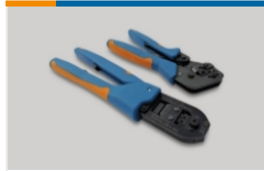
Portable Crimp Tools(2)