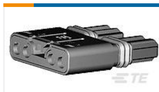
TE Part #2106135-4 Assembly, Free Hanging Plug, SLC, 4 pos