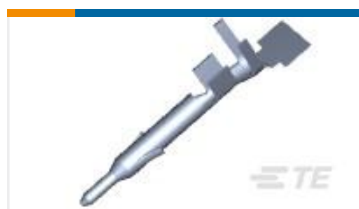
TE Part #770903-6 MINI UMNL PIN 22-18 AWG AU