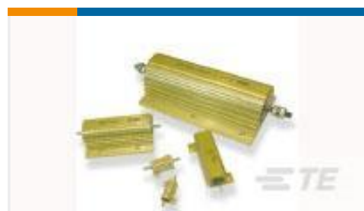
TE Part #5-1625971-1 HSA25 47R 5%