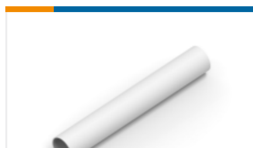
TE Part #NB13462001 RNF-100-3/4-WH-STK