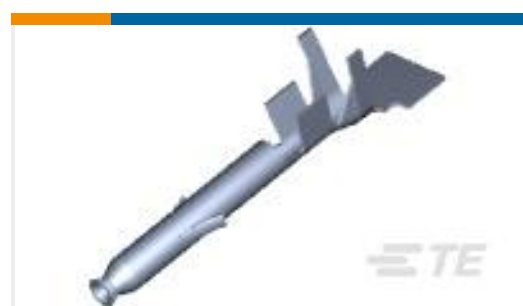
TE Part #770904-6 MINI UMNL SOK CONT 22-18AWG AU