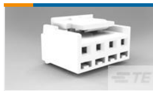
TE Part #2132781-7 07P EP-II HOUSING, NATURAL