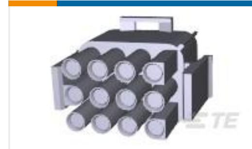
TE Part #794742-1 12P UMNL PLUG HSG NATL