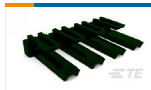
TE Part #1-2132782-2 12 pos. EP II breakaway retain