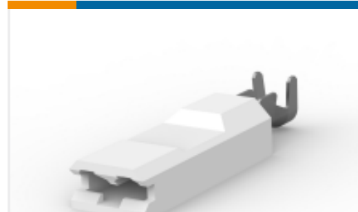
TE Part #521284-2 ULTRA POD: Straight, Receptacle Assembly, Tin Plated, .187 inch