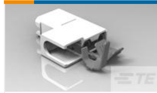
TE Part #521633-2 ULTRA-POD 250 ASY REC 18-14 AWG TPBR