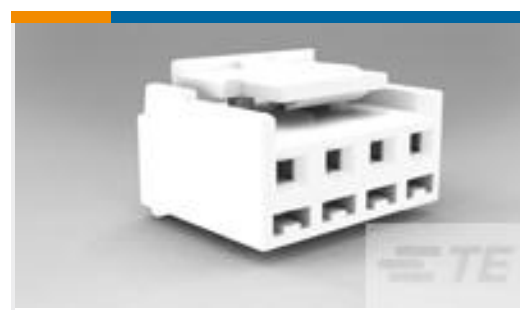
TE Part #2132781-8 08P EP-II HOUSING, NATURAL