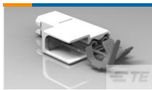
TE Part #521597-2 ULTRA-POD 187 ASY REC 18-14 TPBR