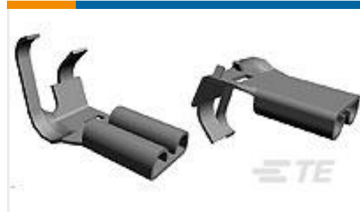
TE Part #42486-2 187 FASTON FLAG REC 20-16 AWG TPBR